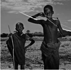
Two young Turkana herders near the village of Kache Imeri in Turkana District, northern Kenya.