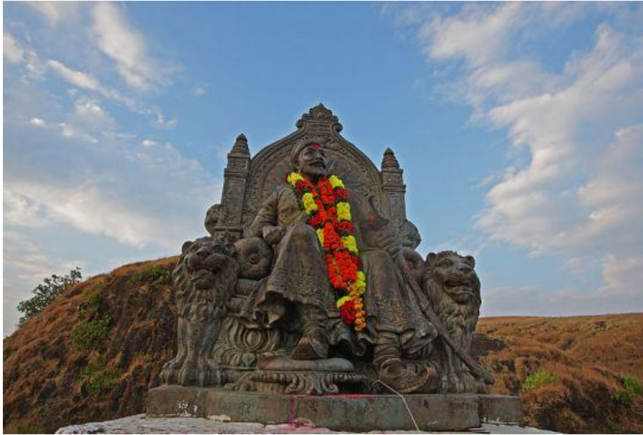
Shivaji, the Maratha warrior

Battling it out with the Mughals in the 17th Century, Shivaji, the Maratha warrior and his army built a fort. This fort was strategically built, impermeable from 3 sides owing to cliffs and terrain and guarded on the fourth. Owing to Shivaji's strategy, the fort was accessible to allies via a single walkway, which made it perpetually inaccessible to foes. This fort still stands today in what used to be the capital of the Marathas, Raigarh. Raigarh was Shivaji's capital, the hill fort where he was crowned (1674 AD) and where he died (1680 AD).