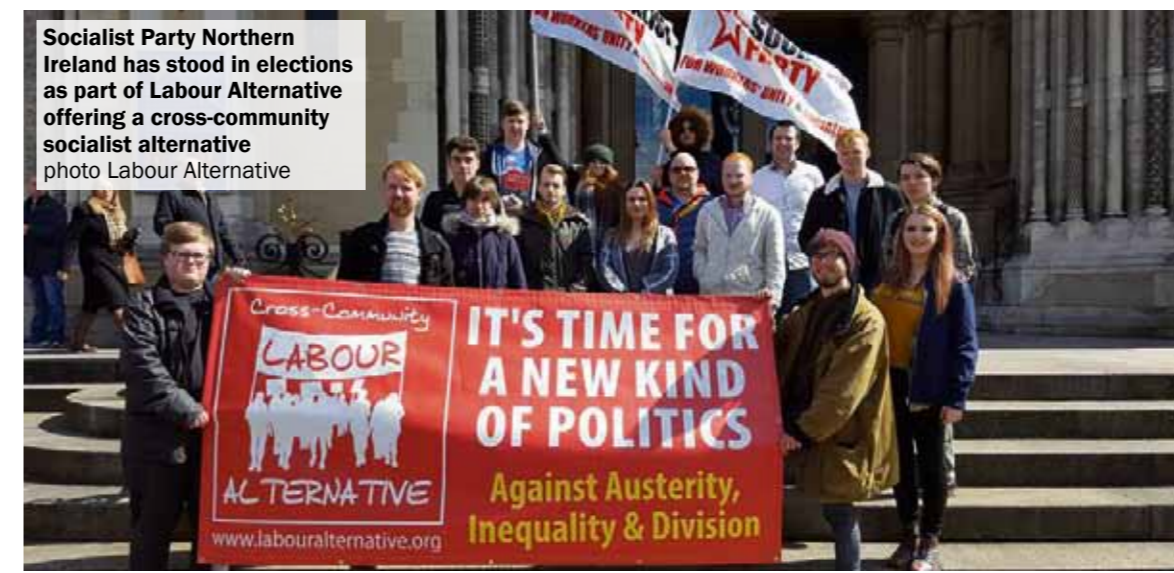
Socialist Party Northern Ireland has stood in elections as part of Labour Alternative offering a cross-community socialist alternative