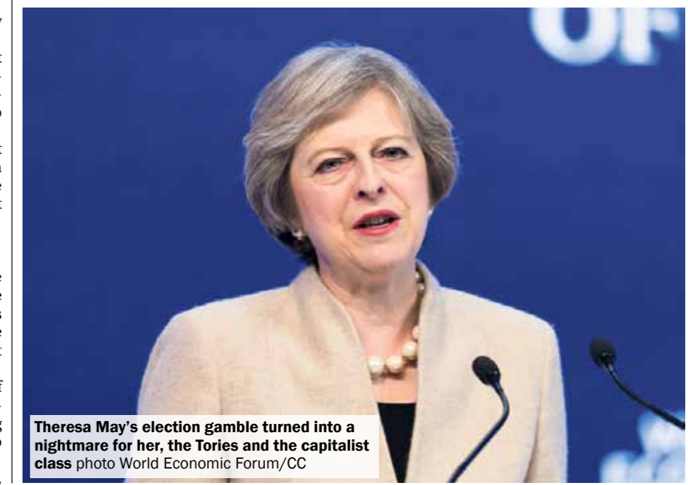
Theresa May's election gamble turned into a nightmare for her, the Tories and the capitalist class

Have you got news for us? DEADLINE: Friday before publication date - urgent news: Monday