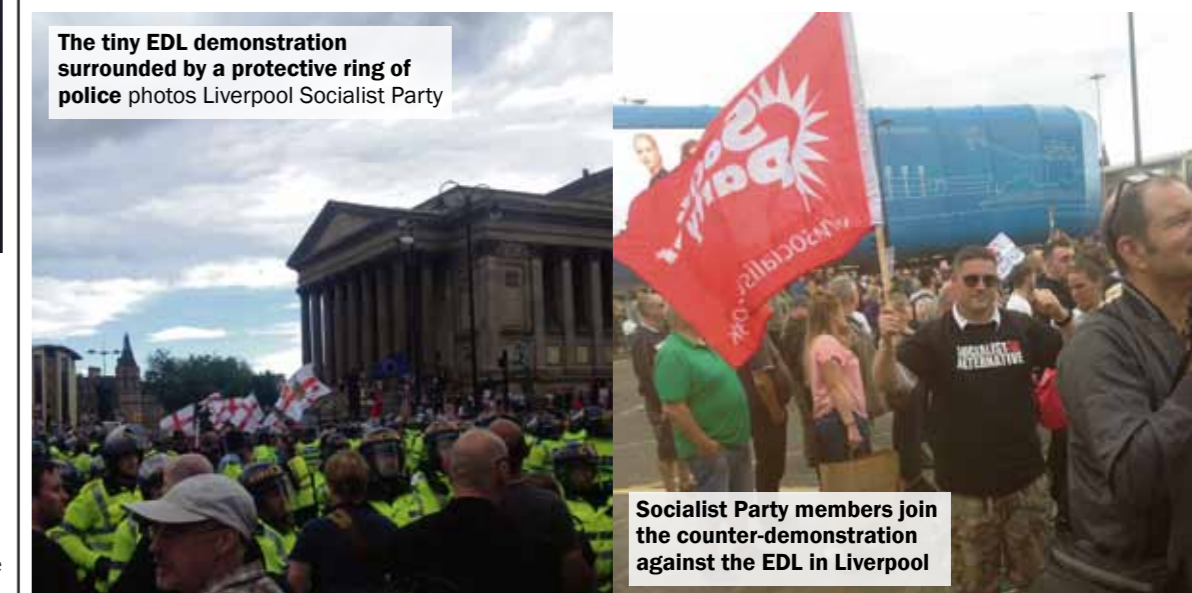
Socialist Party members join the counter-demonstration against the EDL in Liverpool