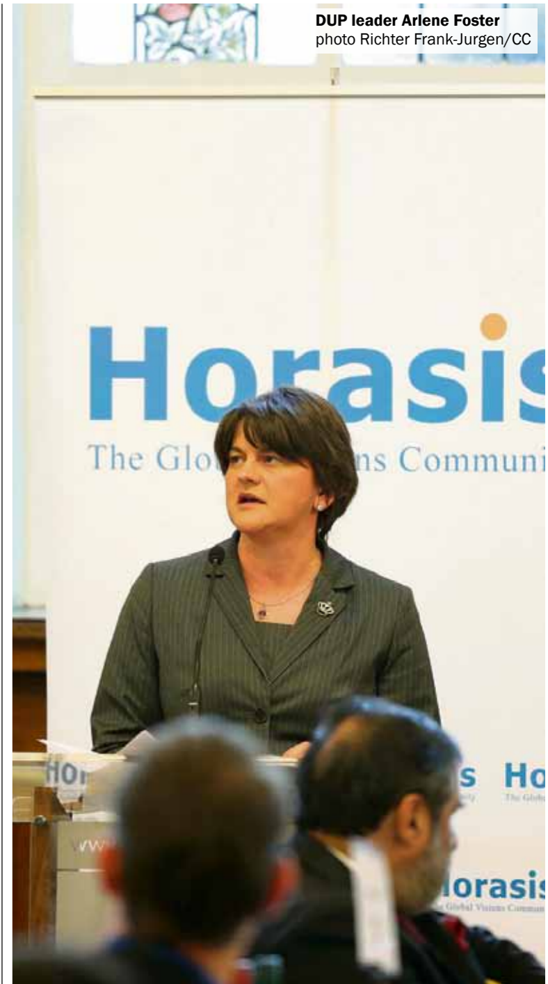
DUP leader Arlene Foster

Despite its rhetoric, Sinn Féin has ideologically embraced neoliberalism. It has dutifully implemented cuts, committed itself to the project of shrinking the public sector in Northern Ireland and campaigned alongside the DUP for a cut in corporation tax. It is also, as the late Martin McGuinness put it, an 'anti-abortion party'.