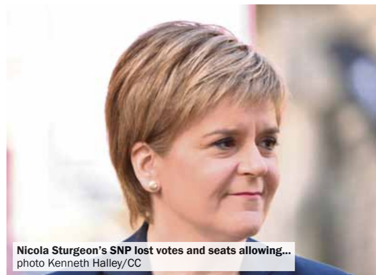
Nicola Sturgeon's SNP lost votes and seats allowing...