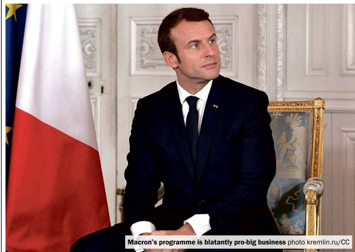
Macron's programme is blatantly pro-big business

Clare Doyle Committee for a Workers' International