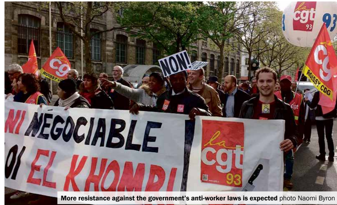
More resistance against the government's anti-worker laws is expected

The right-wing Republicans came second with 15.77% and Le Pen's Front National got 13.2%. Marine le Pen came top of the poll in her northern constituency of Henin-Beaumont (North), but may be defeated by the kind of 'anti' vote which saw Macron defeat her in the