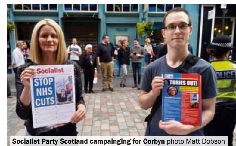
Socialist Party Scotland campaigning for Corbyn

Ruth Davidson's Scottish Conservative and Unionist Party had one policy in the campaign - "no to a second independence referendum".