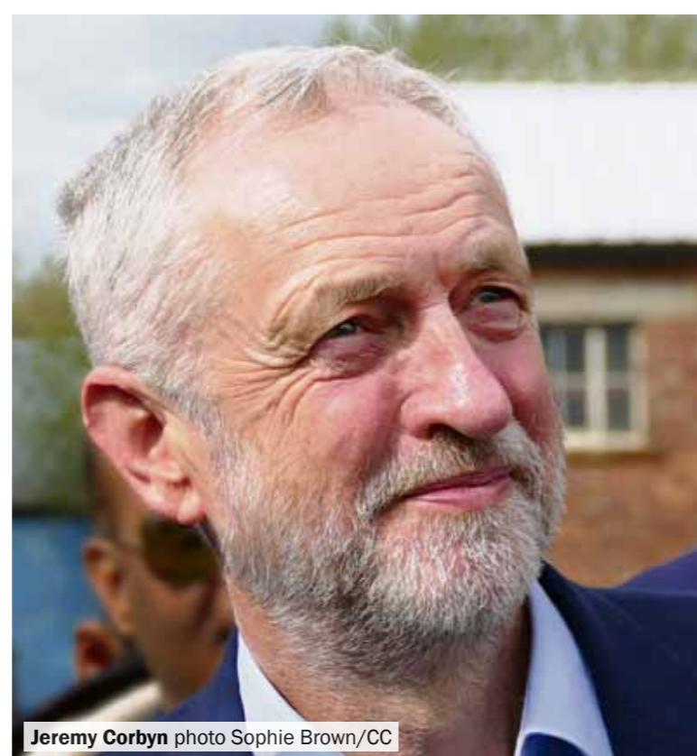
Jeremy Corbyn

To prevent this will pose the need for far-going socialist measures including nationalising the major corporations and banks that dominate Britain's economy. This would allow a socialist government to begin to manage the economy in a planned way under democratic workers' control and management - that really would be "for the many, not the few."