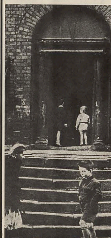
Dublin Slum Illustrates Even Worse Conditions South of the Border

What, if anything, does the Stormont government propose to do about the shortage of houses and the slum conditions in which so many people live? A government report published in 1970 recognised that as many as 100,000 houses in the province were unfit for human habitation. But its building target for the next five years was a mere 75,000, of which only a very few were to replace existing slums. The Executive Committee of the NILP, in preparing its housing policy for the last annual conference, estimated that the actual