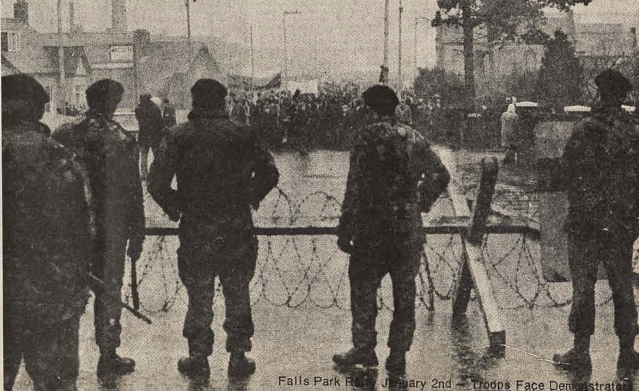
Falls Park Road, January 2nd - Troops Face Demonstration

The current issue contains articles on:- * Black Nationalism * Chile * World Currency Crisis Write for Subscription or Sample Copy (18p inc. postage) to: 375, Cambridge Heath Road, London E2 9RA