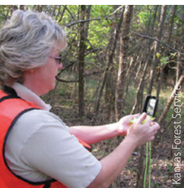
Kansas Forest Service