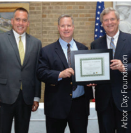
Arbor Day Foundation