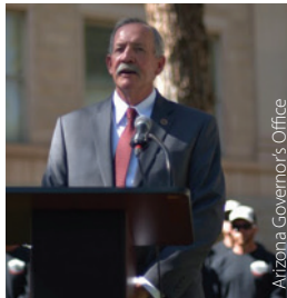
Arizona Governor's Office