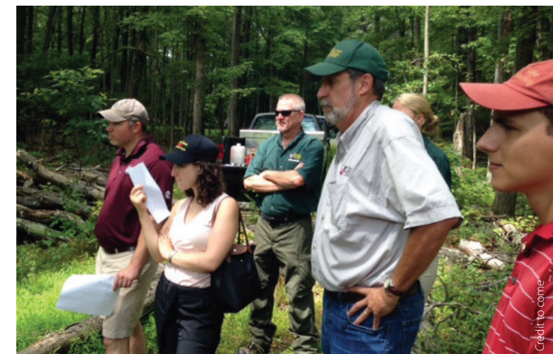
Credit to come