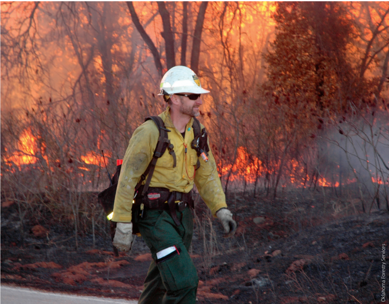
Oklahoma Forestry Services