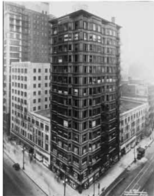
Fig. 2.6 Soot stains on the Reliance Building, Chicago, Illinois, circa 1910