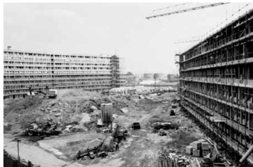
Fig. 8.5 Piles of debris in the Robin Hood Gardens, by Alison and Robert Smithson, 1970