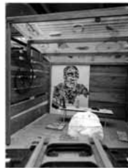
Fig. 8.4 Excavated after an atomic holocaust, The Patio and Pavilion installation, by Alison and Robert Smithson, 1956