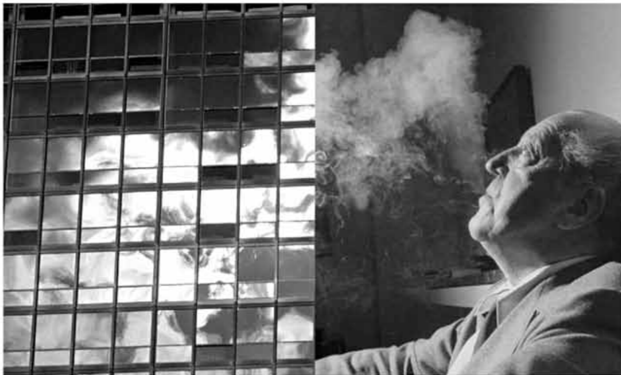
Fig. 2.7 A portrait of Ludwig Mies van der Rohe smoking, Life magazine, 1957