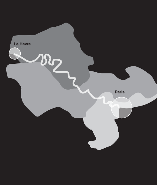
Air Map of Paris, Philippe Rahm, 2007: Rahm's project proposes condensing the historic path of air movement from Le Havre to Paris into a single mechanical system for a Parisian office building. Here geo-architecture engages cartography, matter, and environment, but, ultimately is disentangled from the literal space of the map, and takes on a representational and historical dimension.

practices. The new geographical architecture contains many frustrating tendencies. If architects choose to work at the limit of geography versus the limit of the city, then the best of these new geo-architects might begin a more self-reflective phase—interrogating the aesthetic and historical implications of maps, vectors, and environments. Unlike plans, sections, and spaces, geographical forms of representation tend to take on the mask of natural reality versus representational forms. And in some hands, geography can be turned into a frightening tool to make architectural interventions appear as works of nature, rather than acting as another system for architects to use to tinker with reality. Design and design pedagogy contain forceful and articulate relationships to history, within notions of "parti," "precedent," and "referent." These historically driven terms would sound absurd within most of the geographically oriented architecture of today. Geographical concepts are notoriously ahistorical, and geographers often use this to challenge the primacy of