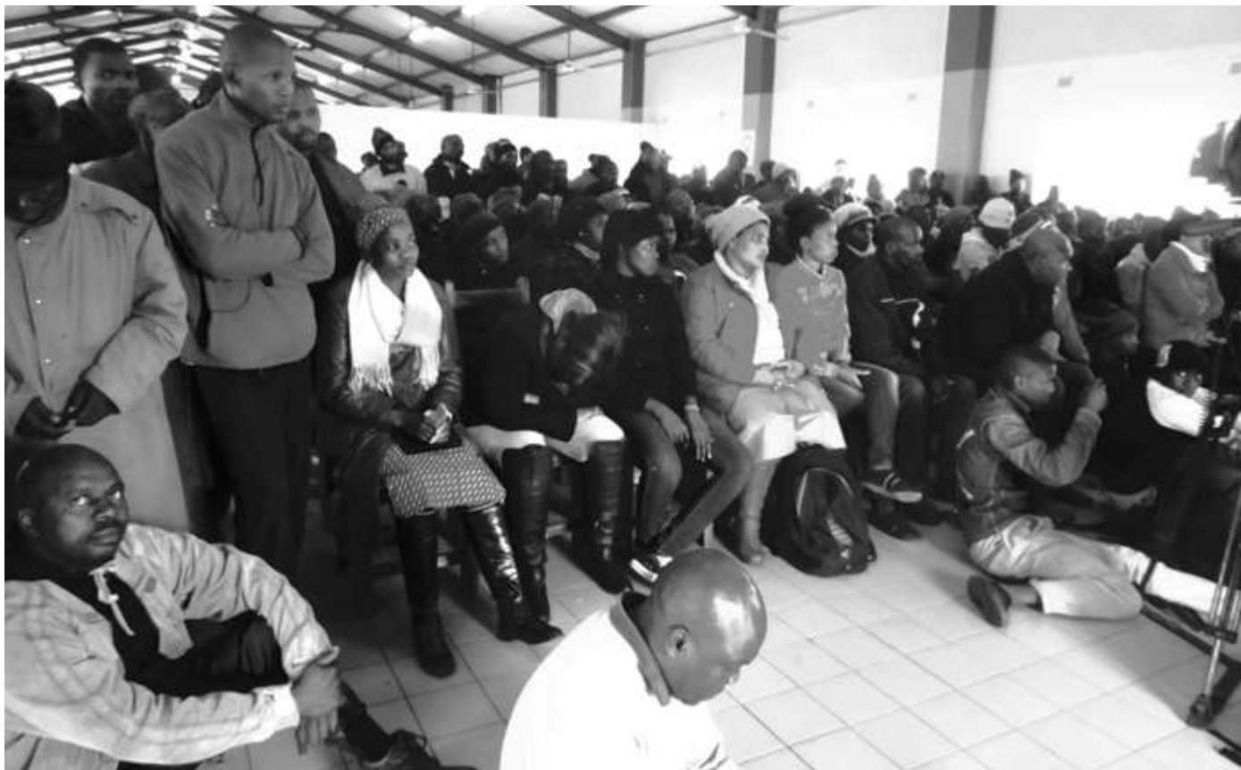
Relatives of the massacre victims meet to discuss the outcome of the Farlam Inquiry

The Otjozondjupa region of the Miners' Union of Namibia has passed a motion in support of an independent inquiry into the Marikana miners' massacre.