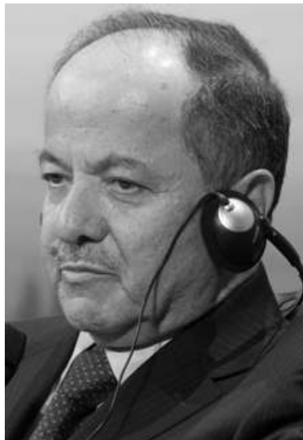
Masood Barzani, Kurdistan client regime leader

2- As a hard weapon, we see how the ideology of Wahabism - Sharia Law - is being used as a sickening weapon for aggression, conquest and regime change. It is hysterically hostile to democratic values: gender equality, the right to strike and to organise, the right to freedom of expression in speech and in writing, etc.