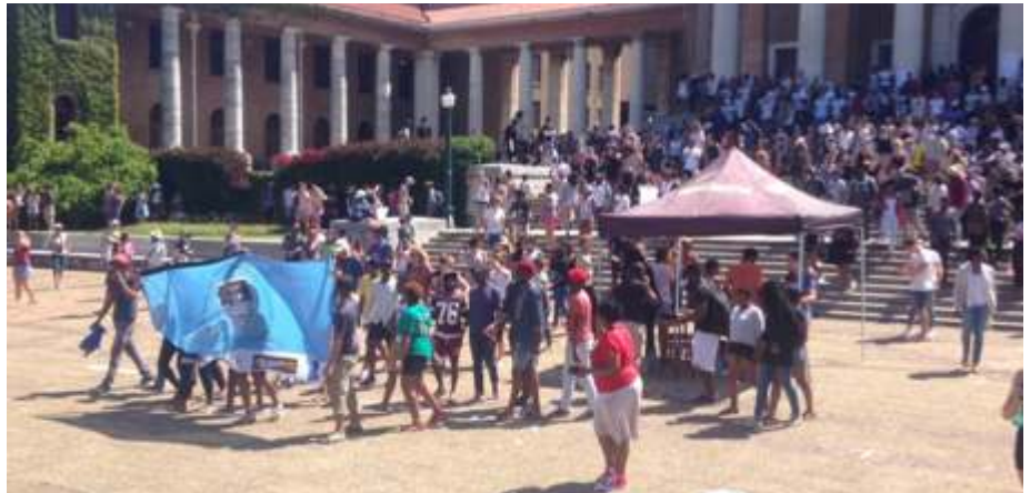
Resistance to student fees swept South Africa's campuses last autumn. This protest was at Cape Town University

The time has come for the few black students who make it there to be joined by the many black people who are excluded, to send a message that the struggle of black university students and workers is the struggle of the black majority of our people who still live with the indignity of white supremacy, oppression and exploitation. The time has come to build on the work of ReformPUK who have forged strong bonds between students who demand the end of financial exclusion, marginalisation through the