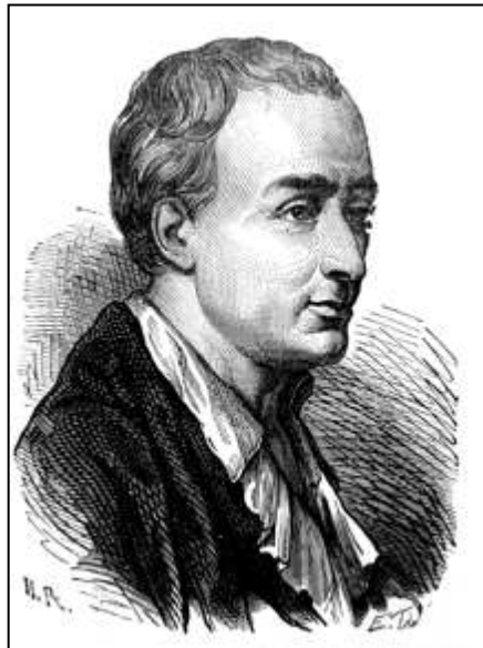
Diderot (above) and Voltaire (right) based their perception on reason and radically criticised religious ideology.

In the wake of World War II the Allied powers split into two hostile camps East and West, the so-called communist states and the free world. This resulted in the