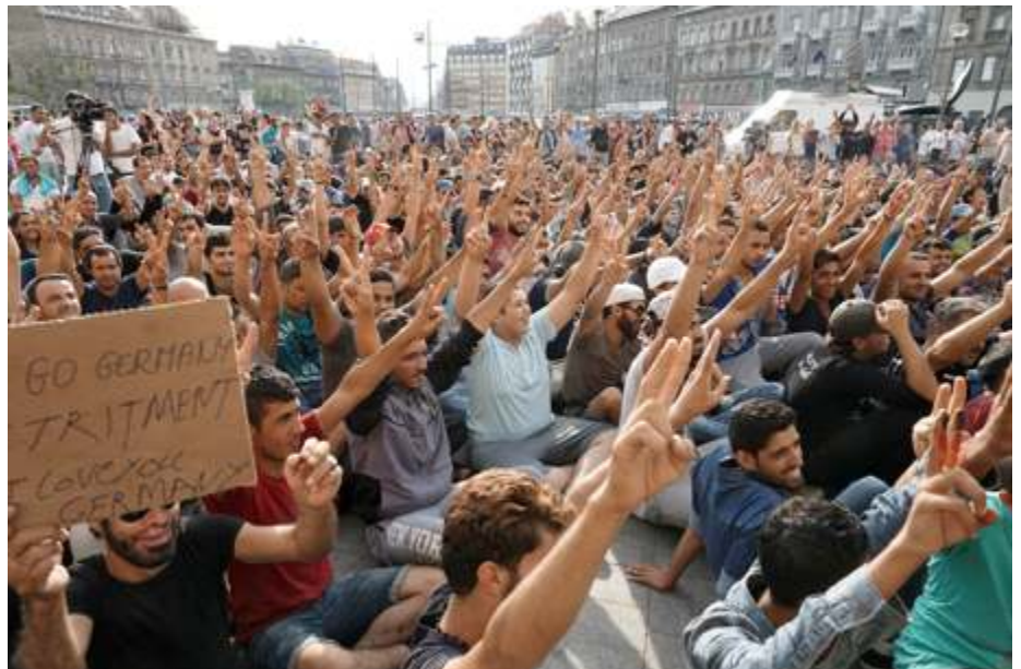
September 2015: Refugees demonstrate outside Keleti station in Budapest.

History now poses the fate of this whole system as an immediate practical