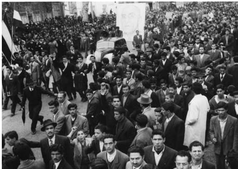
Tehran, Iran, 1952: Masses come out onto the streets to back Dr. Mosadegh.

Afghanistan used to be a fairly secular country, making slow but steady progress. When the Soviet Union invaded Afghanistan, it furnished US Imperialism with an exceptionally inhumane opportunity to plunge the country into being the Soviet Union's Vietnam. Military training, weapons and associated facilities were supplied by the US; Saudi Arabia etc. pro-