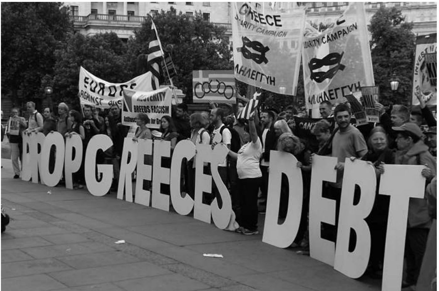
Jubilee Debt Campaign campaigns brought their message to a rally in London to defend the Greek government against financial blackmail

sion on Public Debt and the stand of former speaker of the Greek Parliament, Zoe Konstantinopolou, and the Jubilee Debt Campaign.