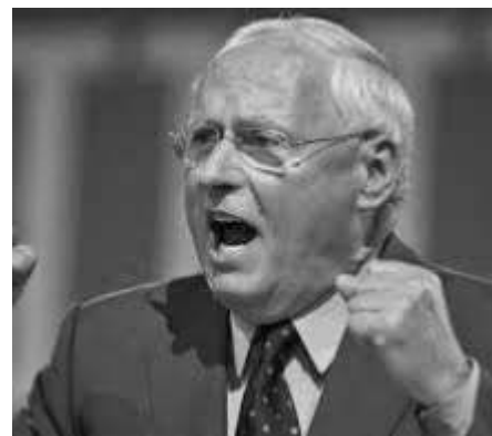
Oskar Lafontaine (Die Linke): "Knows there can be no socialism in one country"

But these productive forces have, under capitalism, a peculiar character. They are only allowed to exist as capital. The increasing impossibility of the productive forces of humanity developing inside national borders translates, under capitalism, into an increasing difficulty any particular capital based on a narrow home market faces in competing with other capitals which have larger markets, are exploiting cheaper labour forces either at