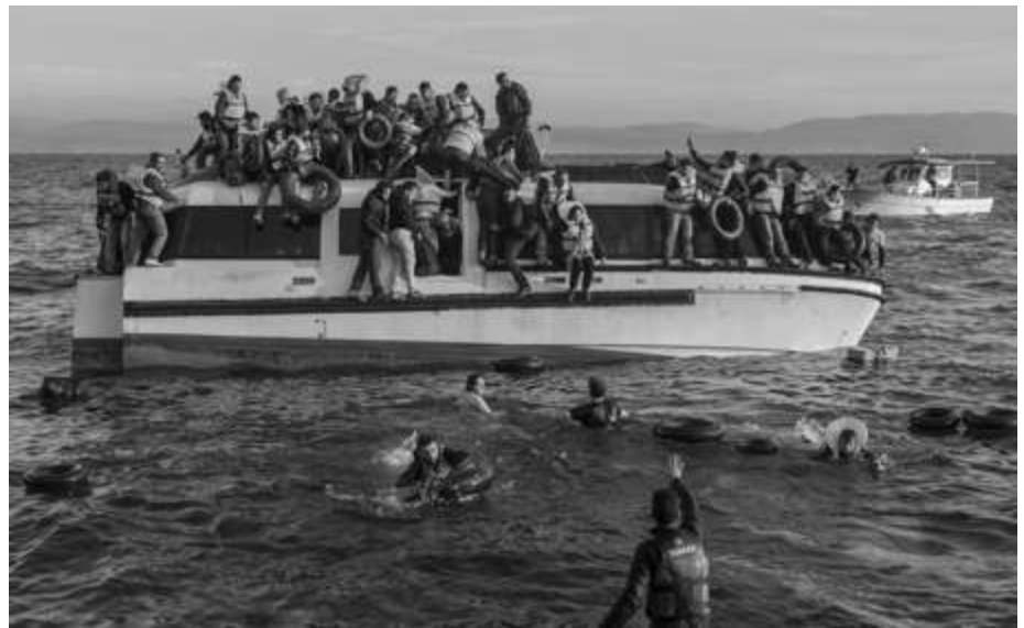
"Defended" by NATO warships, the Aegean Sea crossing will become even more perilous for refugees.

Many new refugees and other migrants still hold medieval or barbaric conceptions which may be customary in the backward areas from which they originate. The worst expression of this is the so-called Sharia and in particular the contempt for and oppression of women codified in that outdated law. Some sons and grandsons of migrants in Europe cities are returning to such views and trying to implement them. The working class movement has to oppose these effects of decaying capitalism. People holding on to such backward conceptions must overcome them and adopt more advanced conceptions and customs.