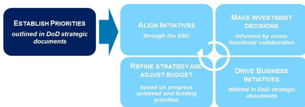
FIGURE 6. PERFORMANCE MANAGEMENT PROCESS

1. Establish priorities. The DoD ASP sets the strategic priorities for the Department. To achieve these priorities and objectives, the Component PSAs identified their most important goals and objectives as documented in this plan. The Component PSA will also work to base their funding priorities on the ASP goals and objectives.