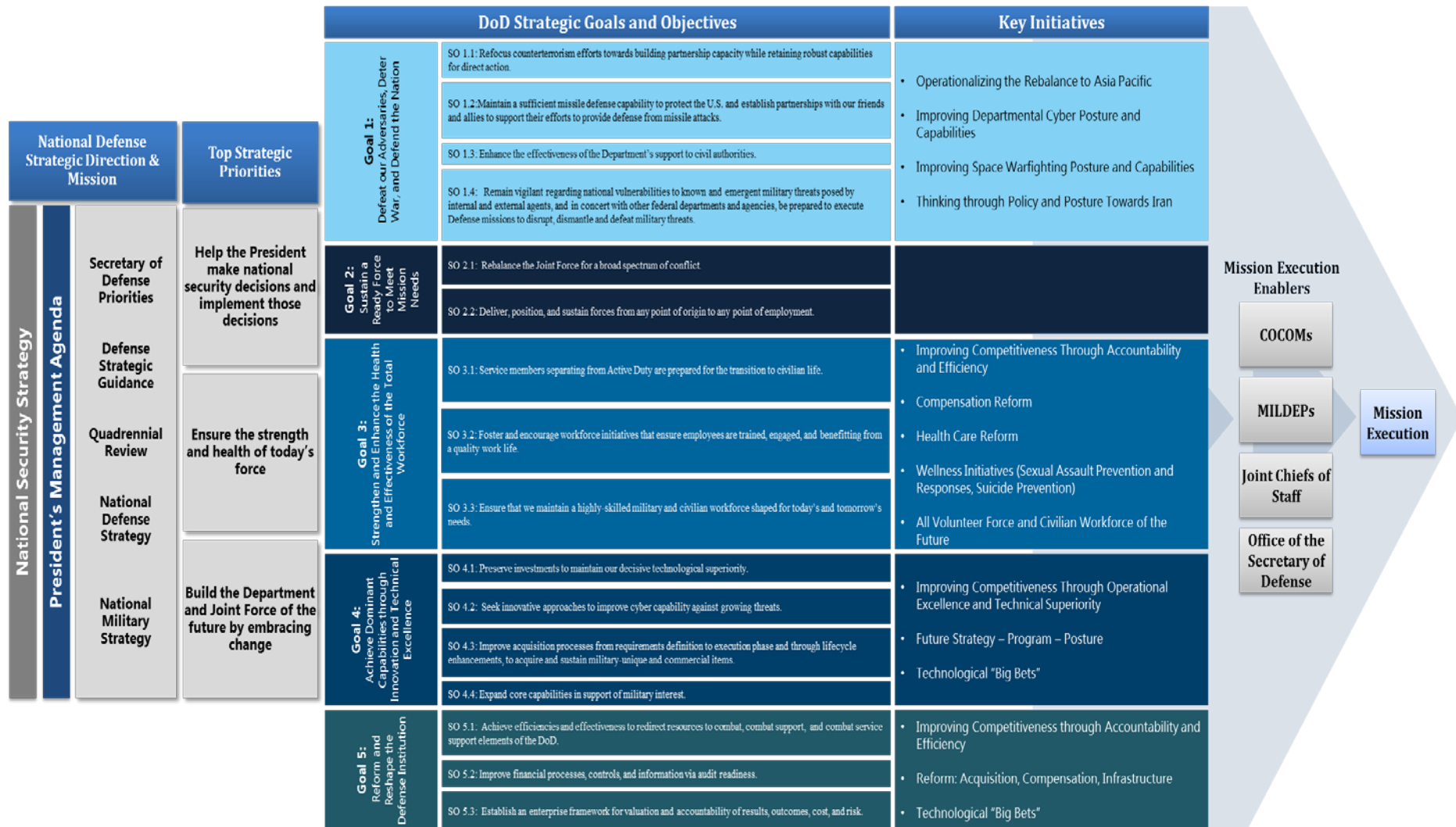
FIGURE 2. DOD AGENCY STRATEGIC PLAN ALIGNMENT