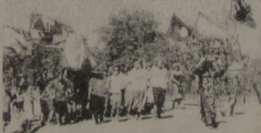
Photo of the Jabiluka blockade, NT, July 1998

MASS BLOCKADE at North Ltd, 476 St Kilda Rd Monday March 29 to Thursday April 1