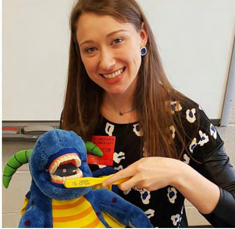
November 5, 2016 Diabetes Day Health Fair

A group of University of Kentucky College of Dentistry students from the Public Health Club presented to various community members of Richmond, KY about the effects of diabetes and oral health. Oral hygiene instructions were demonstrated and information and supplies were distributed.