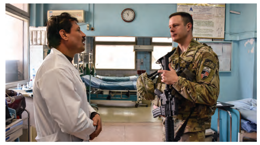
A Sardar Daoud Khan Hospital surgeon and a Resolute Support physicians' advisor discuss the medical management of recently admitted patients following the attack on the hospital in early March.

several news media outlets reported on IS-K's continued ability to conduct deadly attacks this quarter.