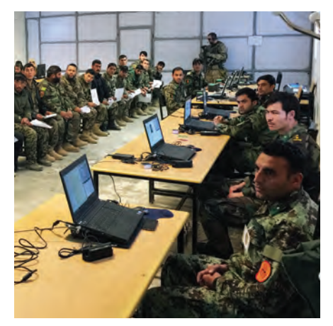
The 209th Corps' biometric enrollment process under way in Mazar-e Sharif in January.

USFOR-A also confirmed that the U.S. will continue to disburse funds only to those ANDSF personnel they are confident are properly accounted for.<sup>220</sup> Accordingly, when CSTC-A withheld funds for those personnel not accounted for in AHRIMS, funding decreased because the MOD and MOI could not prove the stated number of personnel on hand. USFOR-A reported that there has been approximately $15 million in cost avoidance for January and February 2017 alone, but that this amount will continue to