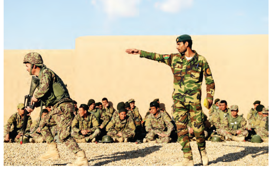
A noncomissioned officer of the ANA instructs soldiers in early March before redeploying on security operations in Helmand Province.

to prevent strategic failure. This quarter, USFOR-A said that RS advisors to MOD and MOI are working with their Afghan counterparts to ensure that risks are considered during planning efforts. However, while the ANDSF did include risk information in their campaign briefs, there was not a notable emphasis on the topic. RS advisors continue to emphasize the importance of identifying and mitigating risks in planning engagements with their counterparts.<sup>188</sup>