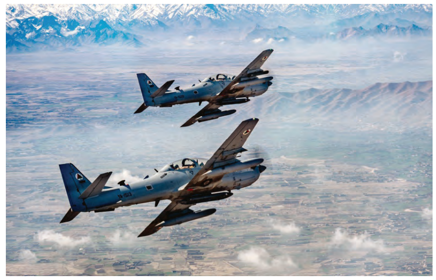
AAF pilots fly A-29 Super Tucanos over Afghanistan during a late-March training mission in preparation for the upcoming spring campaign.

rates, and mission-capability achievement benchmarks for each of its active airframes.