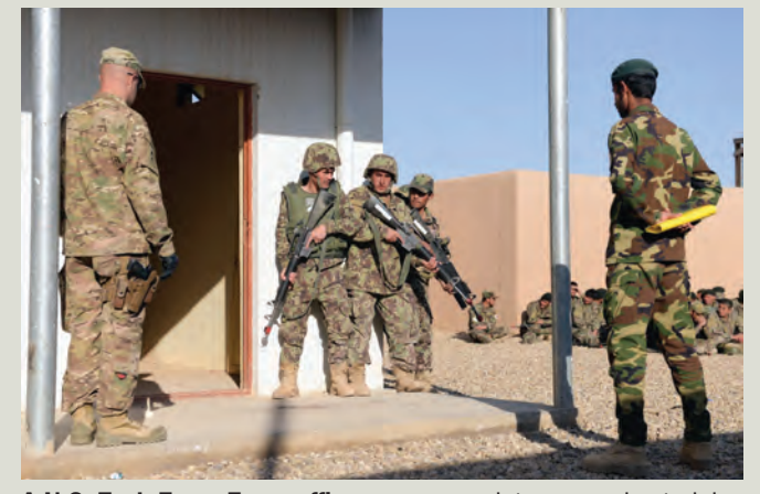
A U.S. Task Force Forge officer oversees winter campaign training of the ANA's 215th Corps at the Regional Military Training Center in Helmand Province.

charges of neglect of duty and theft of supplies and food meant for his soldiers. Theft of supplies, such as fuel purchased by the U.S. government for Afghan military vehicles, has been an ongoing concern and the subject of many SIGAR inquiries.<sup>156</sup>