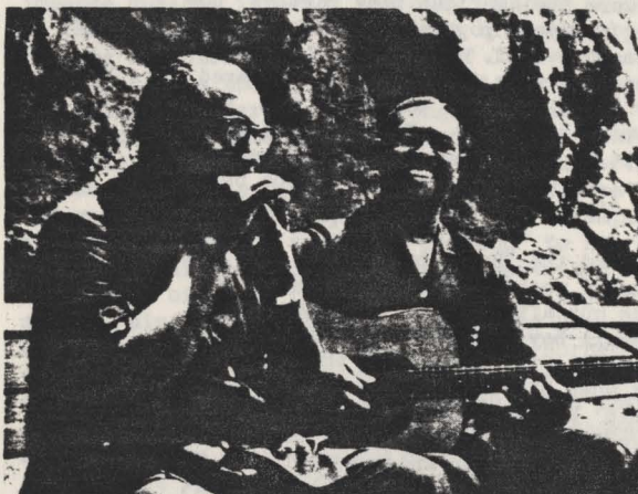
Sonny Terry and Brownie McGhee