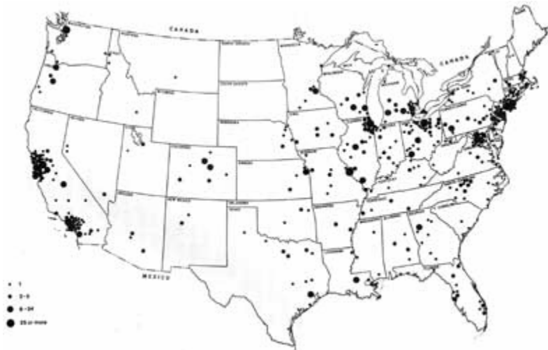
Map 2 Guerilla Attacks in the U.S., 1965-1970

Attica symbolized the crisis of legitimacy which shook the United States in the early 1970s. Millions of people were no longer content to live by the previous rules governing social interaction. From blind patriotism to restitutive justice, previously accepted values lost their magical ability to mold behavior. The work ethic, bureaucratic authority, and compulsive consumption were challenged by the generation born after World War II—a generation raised amidst unprecedented prosperity. As the baby-boomers began to develop a culture based on cooperation and communalism, it appeared to many Americans that their children had gone crazy, that the comfort they had struggled through the Depression to achieve for their families was being rejected as corrupt. What the Diggers had said in 1966 seemed to express the feelings of millions of people in the early 1970s: