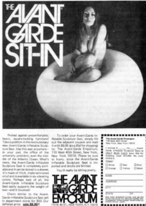
Figure 1 Ramparts, April 1970: Sexism and Depoliticization.

By 1970, the autonomous women's movement experienced phenomenal growth, as women's groups sprouted up on college campuses, in industry, in cities, and in suburbs. Like the black movement, the women's movement contained a diverse membership, and in 1970, radical feminists became the leading force within the feminist movement. That the "personal is political" had long been discussed by the New Left, but never before had the legitimacy of heterosexual relationships and patriarchal domination been challenged as it was in 1970. As radical feminists consolidated their hegemony within the women's movement, women occupied buildings and set up women's centers, and they fought the police for control of their newly won territory. In New York, the offices of the Ladies Home Journal were occupied by women whose demands included an entire issue devoted to feminism and an end to the portrayal of women as mindless commodities.