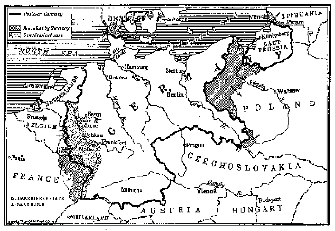
GERMANY BEFORE AND AFTER THE FRENT WORLD WAR

Who had an interest in preserving the unsustainable, atavistic arrangement for Danzig? Not Poland. Not Germany. Not France. The only interest it served was England's. It was one of those possible casus belli that England kept up all around the world.