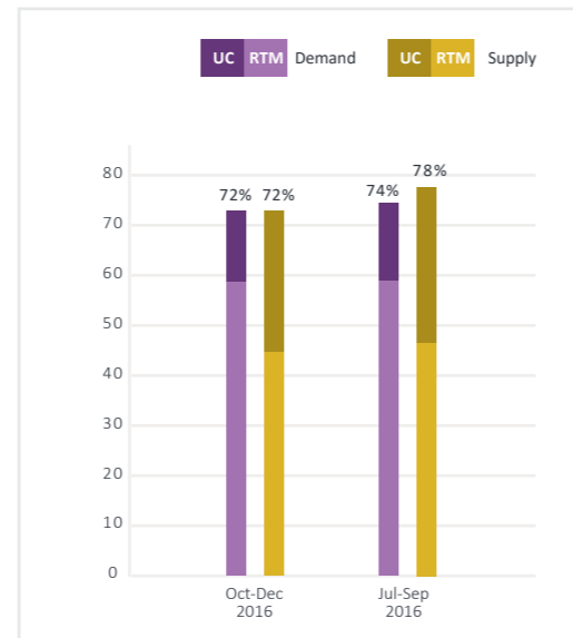
Graph depicts the availability of residential apartments wrt other property types, QoQ, along with the distribution of under-construction and ready stock