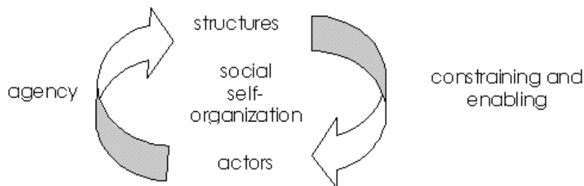
Figure 1: Social self-organization

The dynamic character of social systems can be achieved by the mutual production of human actors/groups and social structures [cf. fig. 1]. This process can be termed social self-organization or re-creation of a social system [20, 21]. The synergies of communication processes result in the production and reproduction of social structures, these structures enable further practices and communications by which social structures can again be produced and reproduced, etc. This process is self-referential, recursive, and cyclic, social systems permanently change themselves, their dynamic is given by an endless emergence of social structures from practices and communications of human actors and vice versa. Social structures and human actions/communications produce each other mutually. Anthony Giddens has termed this cyclical process the duality of structure and has considered structures as medium and outcome of human practices, they enable and constrain actions. "According to the notion of the duality of structure, the structural properties of social systems are both medium and outcome of the practices they recursively organise" [27, p. 25, for a discussion of how Giddens' structuration theory fits into the framework of a theory of social self-organization cf. 21].