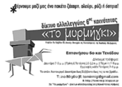
Poster for a fundraising event for the "Solidarity Network of the 6th section of Athens – Mirmigi (ant)"