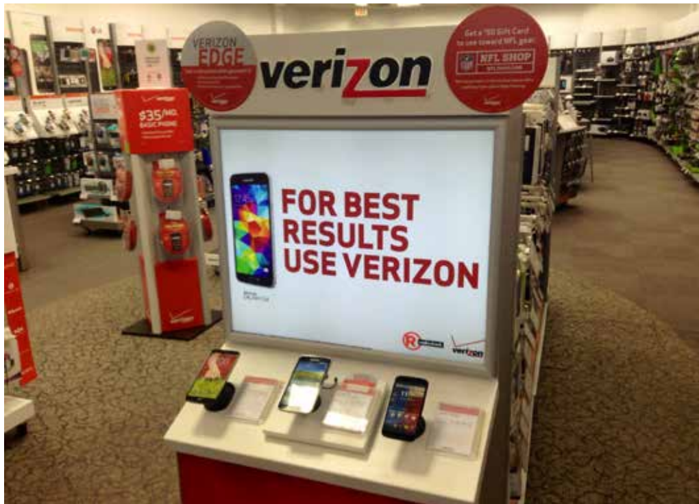
Verizon store ad.

Department of Fair Employment and Housing. Attorneys with the DFEH launched a two-year investigation and eventually found that the practice of denying or failing to give employees timely approval for family or medical leave was so widespread that it amounted to company policy. Up to 1,000 Verizon employees, DFEH lawyers estimated, had been denied their rights in California alone. 47