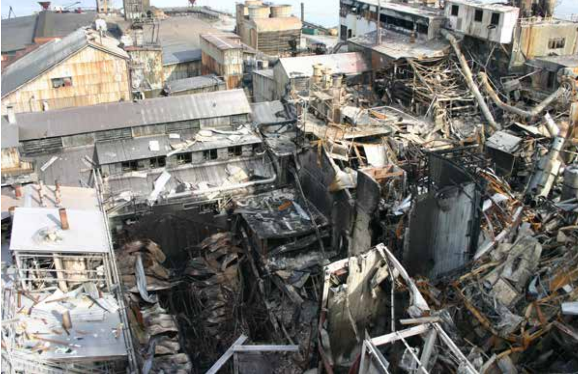
Damage caused by Imperial Sugar refinery explosion at Port Wentworth, Georgia. U.S. Chemical Safety and Hazard Investigation