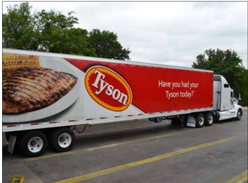
Tyson truck. Capital Area Food Bank of Texas.

"I wouldn't wish that place on anybody I know and love," she says. 18