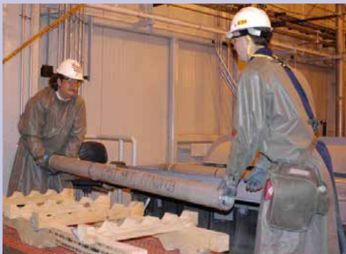
Workers at Tooele Chemical Agent Disposal Facility dismantle chemical weapons. U.S. Army's Chemical Materials Activity