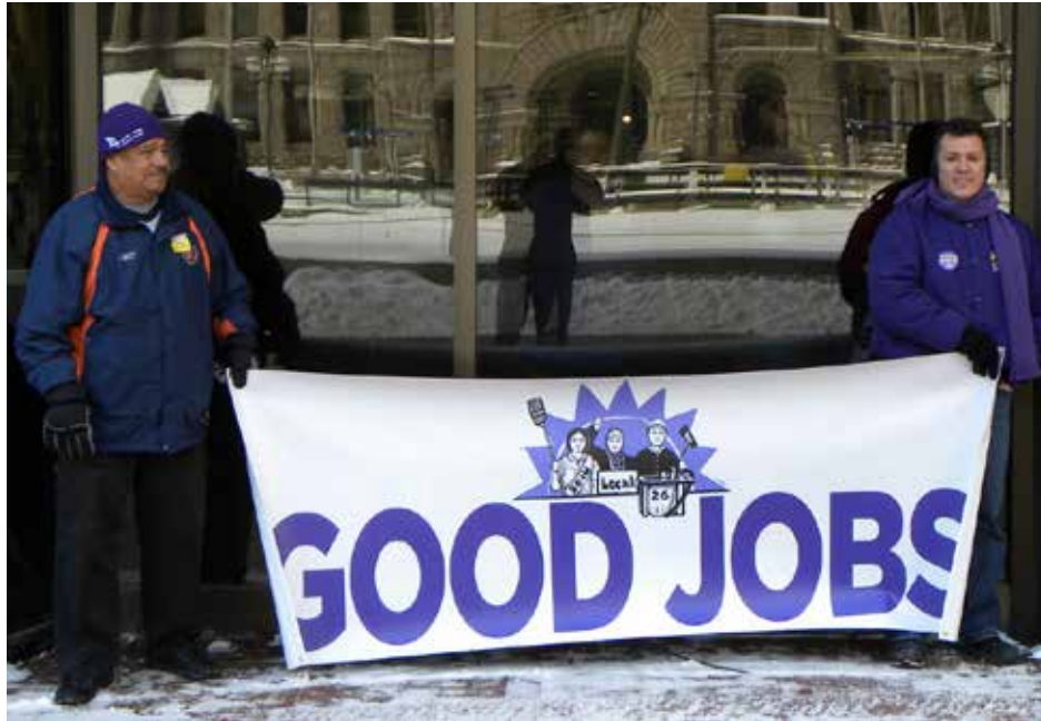
Page 16: SEIU March for Good Jobs and a Green Future in Minneapolis.