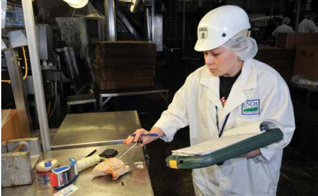
Government poultry inspector tests chicken breasts at a Tyson Foods plant.

the chain snapped, and the lift fell to the floor, crushing Rodney beneath it.