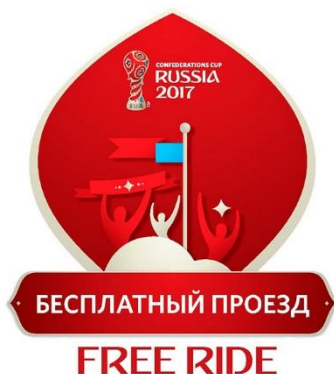
Free Ride Symbol for subsidised transport

Throughout the tournament, subsidised public transport will be provided for spectators of the FIFA Confederations Cup 2017. There will be a number of routes and vehicles in each Host City which offer spectators complimentary travel. The vehicles and stations / stops included in this scheme will be marked with a special symbol in order to be easily identifiable to spectators. This symbol will be an outline of fans within a red or blue dome with “Бесплатный проезд / Free Ride” written underneath. The symbol may also be in black-and-white.