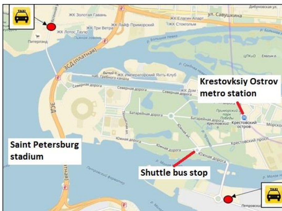
Shuttle bus stop and metro station, Saint Petersburg

run for three hours following the final whistle. Each of these buses will be accessible and have one wheelchair user space. The metro stations from which the shuttles depart are not accessible.