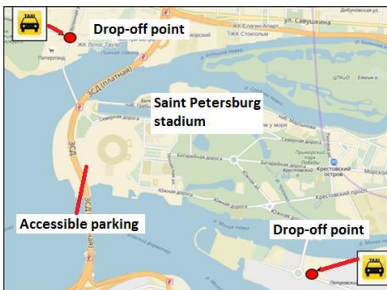
Drop-off points and accessible parking, Saint Petersburg

Ulitsa. The drop-off point south-east of the stadium is located on the corner of Petrovskiy Prospekt and Petrovskaya Ploschad.