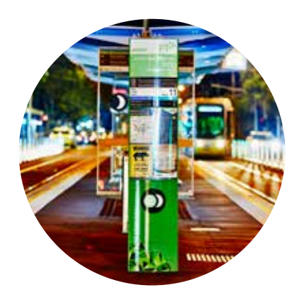
Visitability, connectivity, accessibility – it will be easy to get here and easy to get around Victoria.