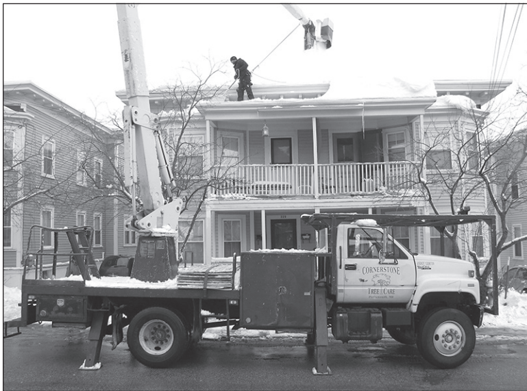
After a mild early winter it's beginning to look a little like 2015.

On Sunday, February 26th, Sunday Morning Civics will have a special Guest: First District Congresswoman Carol Shea-Porter. She will talk about representing New Hampshire issues in Washington.