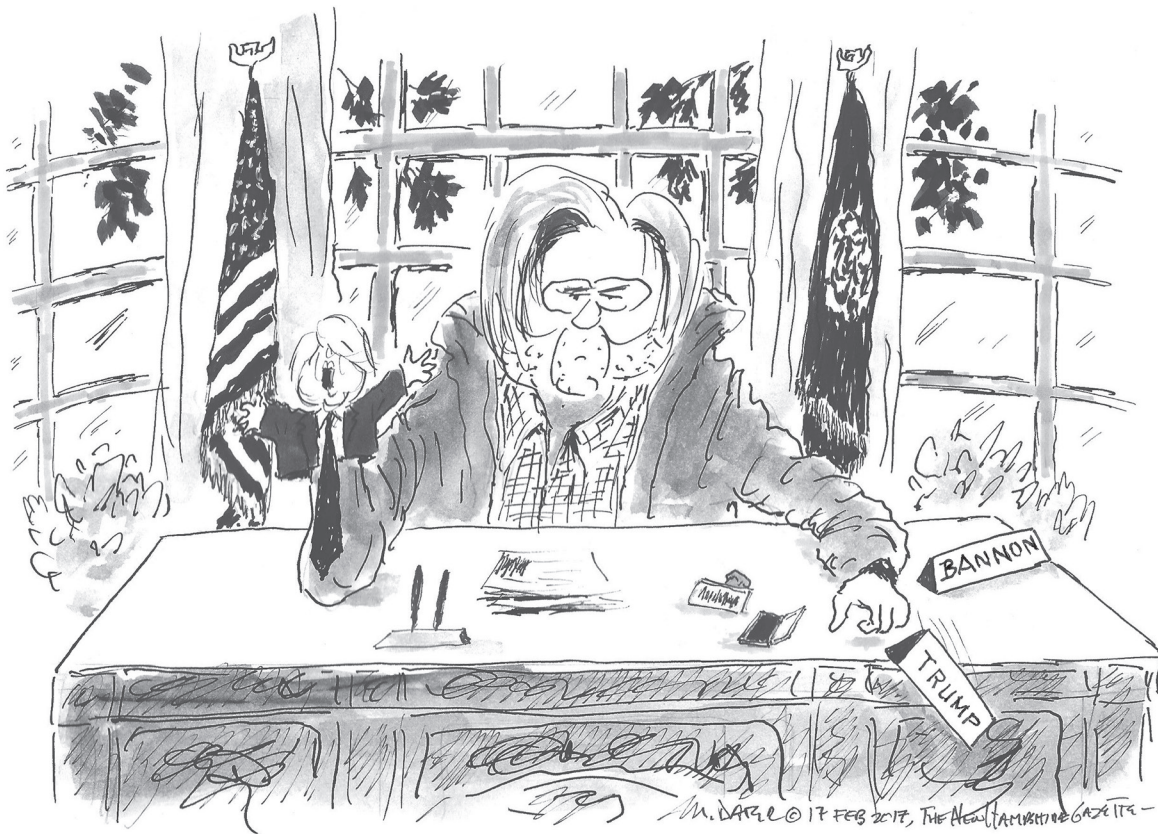
© THE PRESIDENT HARD AT WORK

The history of this controversy makes it clear that if the Governor truly wants to be helpful, the best thing he can do is go interrogate himself.