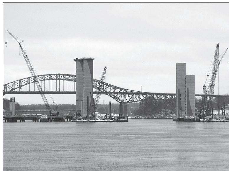
The insanely cool new Lego™ bridge appears to be stacking up nicely. If all goes according to schedule we'll be driving across it in approximately seven months. We don't know what they're paying those boys, working in the wind out in the middle of the river in the middle of the winter, but we're pretty sure they're earning it.