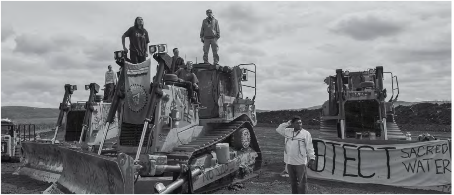
September 6, 2016: Water protectors stand on heavy machinery after halting work on the Energy Transfer Partners Dakota Access oil pipeline near the Standing Rock Sioux reservation in North Dakota.

ON THE FRONTLINES OF ECOLOGICAL RESISTANCE