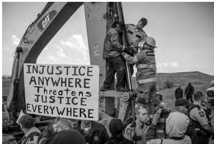
Cops and fire fighters attempt to remove a land defender locked to machinery.

As Dakota Access raced to complete construction, and the injunction stopping work near sacred sites was lifted, the next weeks saw caravans bringing water protectors to work sites further from the camps. Policing of the protests has escalated as well—planes and helicopters have been increasing their presence, along with armored vehicles. Cops have shut down roads to prevent protests, spread rumors accusing indigenous protesters of cattle and horse theft, and shot down a drone people were using to monitor law enforcement. Activists haven't allowed the heavy policing to deter them though. Construction was stopped multiple days in a row in early October—on the 5 th over 150 people caravaned to multiple sites and once again shut them down; workers heard they were coming and were already leaving when they arrived. On the 17 th a bridge between Bismarck and Mandan in North Dakota was blocked. Over the weekend of October 22-23, remaining sacred and burial sites were defended from Dakota Access, and despite a massive and violent police