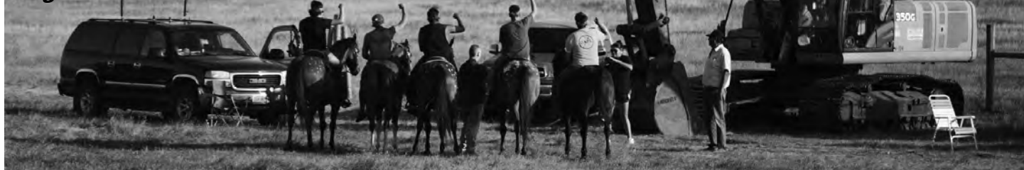
Tribal warriors greet pipeline security with their fists in the air after an agreement with the Standing Rock Sioux Tribe to halt construction on the west side of the Missouri River.

The proposed Dakota Access pipeline would transport around 450,000 gallons of oil daily over 1,000 miles from North Dakota through South Dakota and Iowa to Illinois, where it would connect with pre-existing infrastructure. It would cross the Missouri River twice, which is the primary source of drinking water for the Standing Rock reservation, and run above the Ogallala Aquifer, one of the largest in the world, prompting concerns over water contamination in the likely event of a rupture or spill. The parent company of Dakota Access, Energy Transfer Partners, never properly consulted the Standing Rock tribe and have forged ahead without permission from the Army Corps of Engineers to run the pipe beneath the Missouri River in one of the proposed spots near Lake Oahe. The Standing Rock Sioux, along with other indigenous people and allies from around the country, have camped in the pipeline's path and disrupted work nearly every day since construction began. Documenting all the legal challenges and direct actions that have happened this year would take more space than we have, so the following is a brief summary of some of the events.