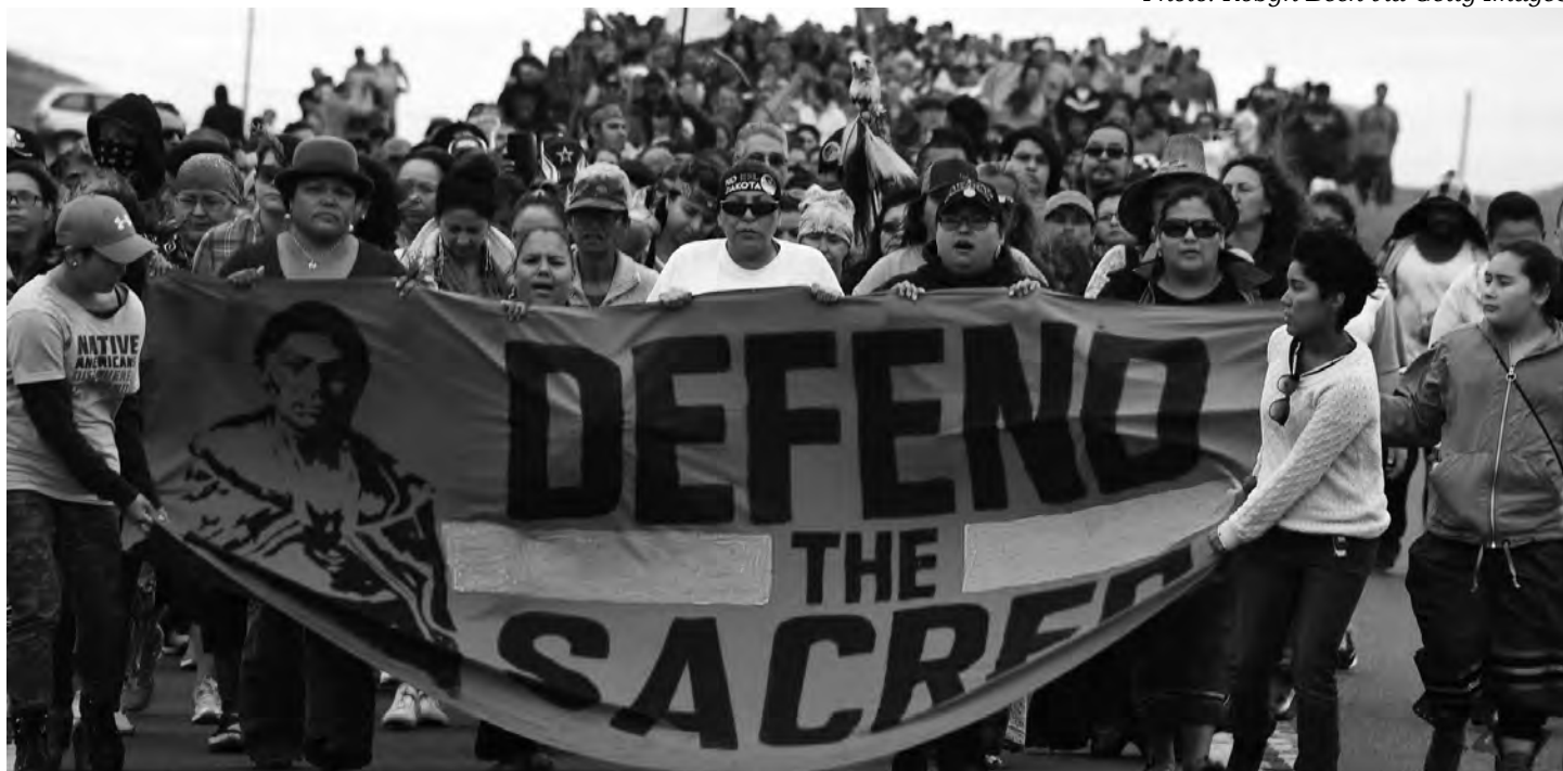
Tribal members and allies marched to the area where sacred sites were bulldozed by Dakota Access.

The fight over Dakota Access not only highlights widespread concern over the oil industry and climate change, but specifically calls into question how indigenous sovereignty is still trivialized and ignored. Once again, people in frontline communities are being forced to defend their lives against capitalism and are demonstrating how it can be done in a long-term and effective way. To stay updated on the fight against Dakota Access, visit EARTHFIRSTJOURNAL.ORG/NEWSWIRE and UNICORNRIOT.NINJA . To donate to the camps, go to SACREDSTONECAMP.ORG/FAQ or send supplies, cash, or checks directly to Sacred Stone Camp, PO Box 1011, Fort Yates, ND 58538. ✂