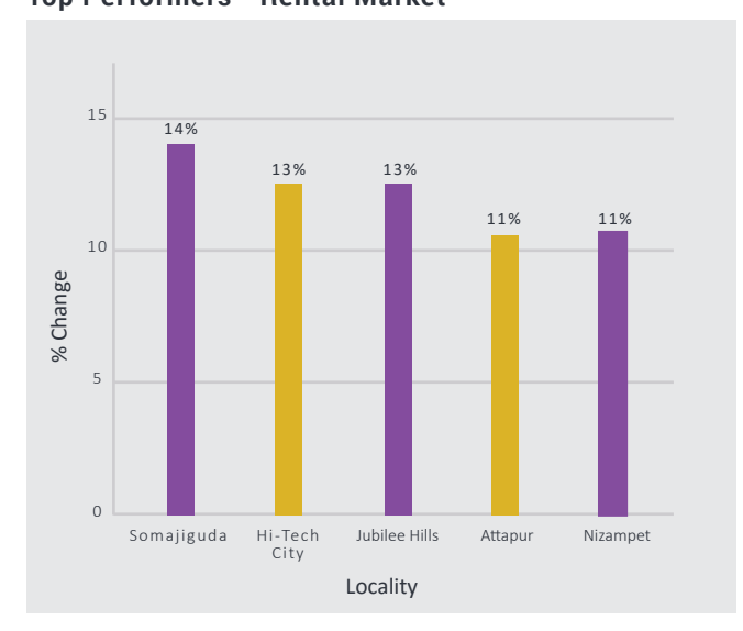
* %change represents yearly rental movement