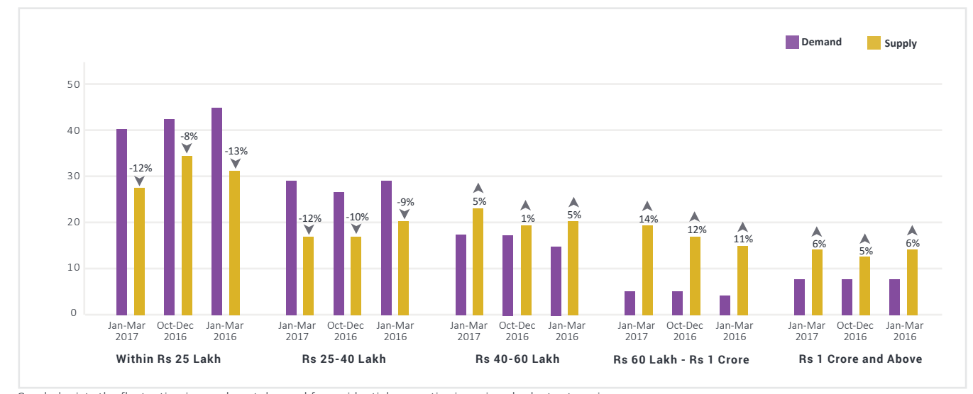
Graph\ depicts\ the\ fluctuation\ in\ supply\ wrt\ demand\ for\ residential\ properties\ in\ various\ budget\ categories