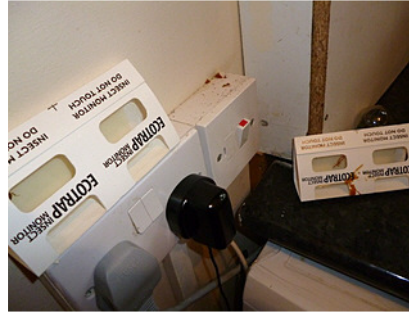
Cockroach traps: Cascade Housing