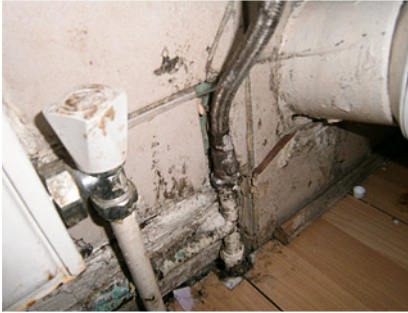
Bathroom: Cascade Housing