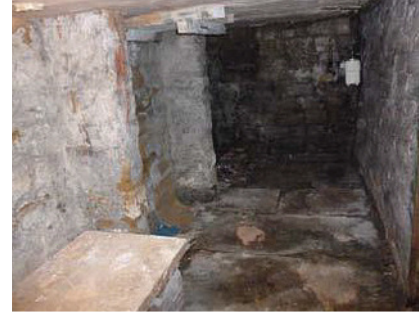
Electricity meter: Barnsley

In June 2012 G4S and two other security firms were handed the largest Home Office contract ever – potentially £1.8 billion over 7 years – the COMPASS contract to provide houses to people seeking asylum.