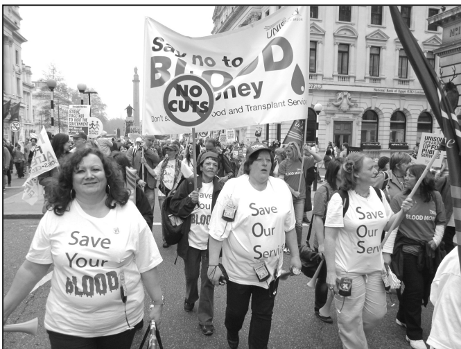
National Blood Service workers fight privatisation threat

But the long-term plan to privatise the NHS is still in place. With all the Government amendments the Bill will still: