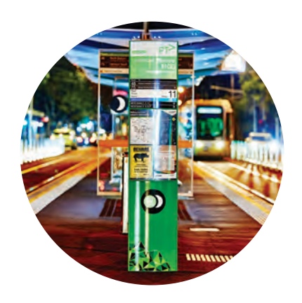
Visitability, connectivity, accessibility – it will be easy to get here and easy to get around Victoria.