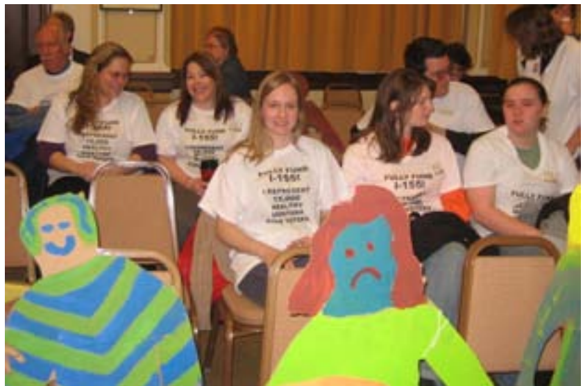
The Human Rights Network and allies staged a sit-in to protest the Senate Finance Committee's decision to cut funding for the Healthy Montana Kids Plan.