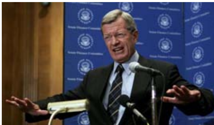
US Sen. Max Baucus (D-MT) is facing pressure from constituents in Montana to put establishing a Single-Payer System back on the table when it comes to healthcare reform.

The Network believes that any healthcare reform