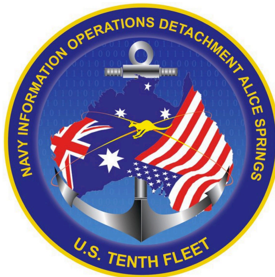
Figure 4. NIOD Alice Springs U.S Tenth Fleet