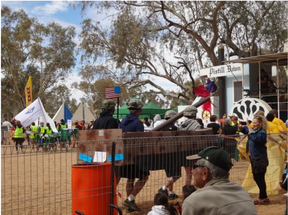
Figure 21. US Army team, Henley-on-Todd boat races, Alice Springs, 18 August 2012