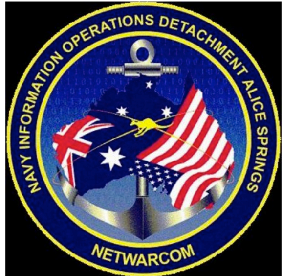
Figure 3. NIOD Alice Springs NETWARCOM