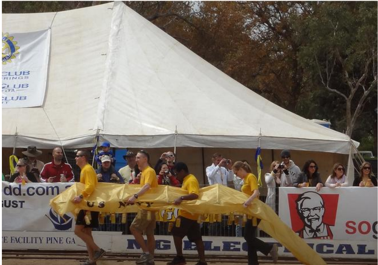
Figure 22. US Navy team, Henley-on-Todd boat races, Alice Springs, 18 August 2012