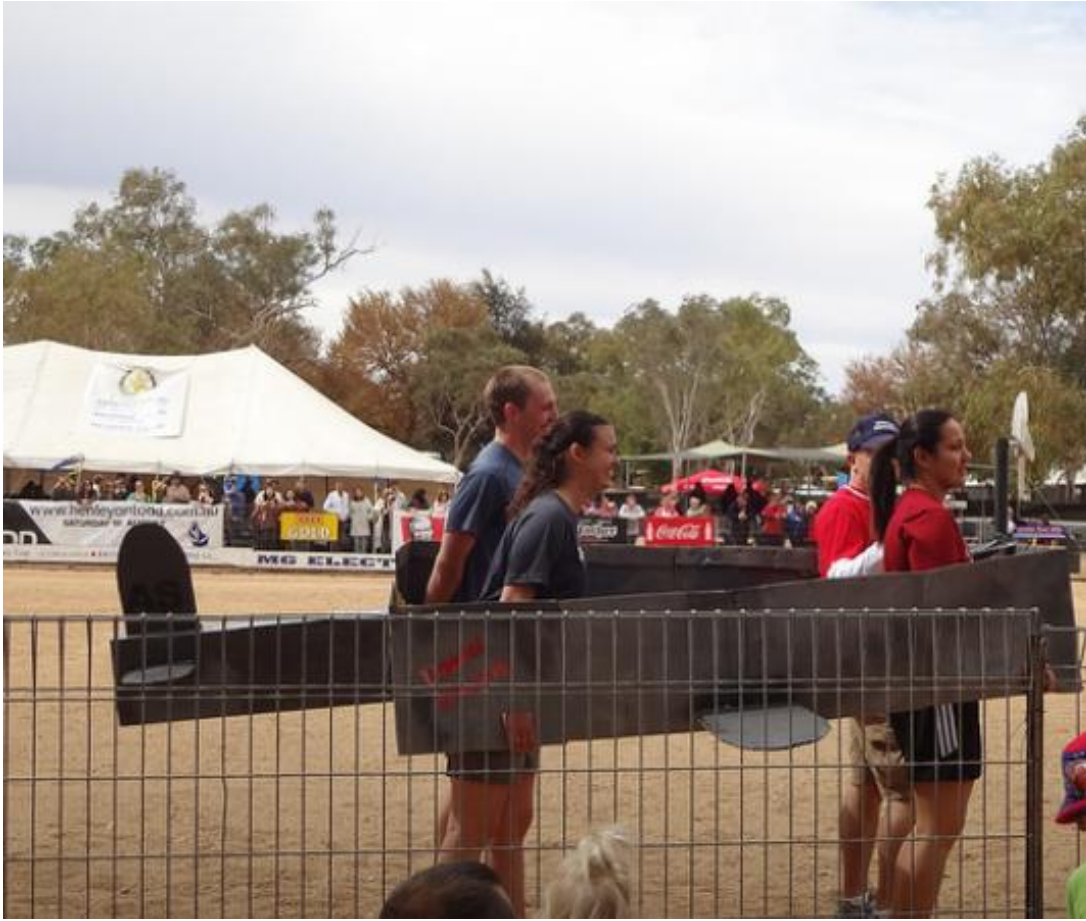
Figure 20. USAF team, Henley-on-Todd boat races, Alice Springs, 18 August 2012