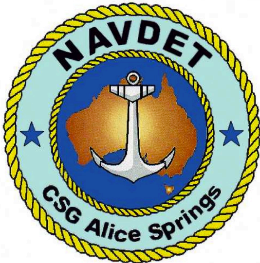
Figure 2. NAVDET CSG Alice Springs