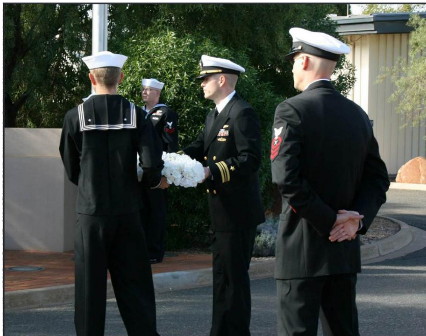
Figure 9. Lieutenant Commander Ken St. Germain, NIOD AS Commander, 2011-13