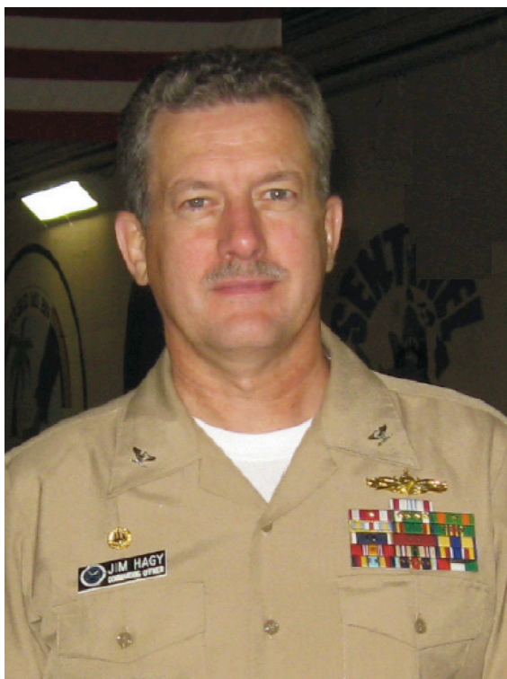
Figure 6. Captain James Hagy, NIOD AS Commander, 2000-02