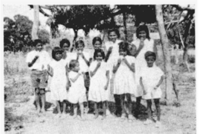
This happy group of Balranald Sunday School children seem to be enjoying something nice. It wouldn't be watermelon already, would it?

inquisitive youngsters by driving a small screw eye into the end of the clothespeg and hanging it from a nail.