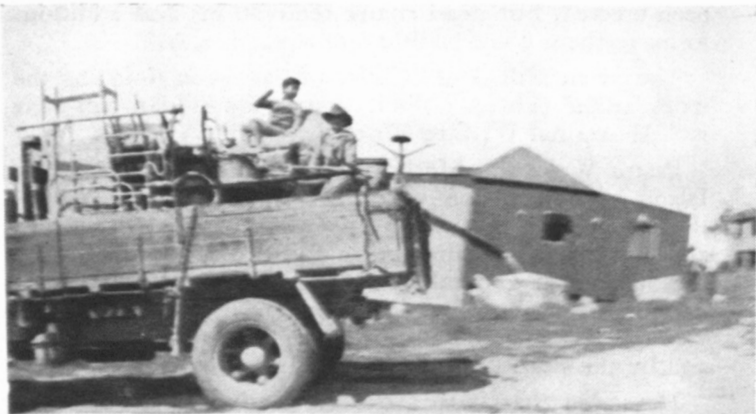
When "Moving Day" came round to Yass recently, everything was piled on the old lorry for transport to a new home.

If you have photos at home, similar to those you see published in Dawn , send them along and thus add to, and maintain, the interest in your fellow men and women.