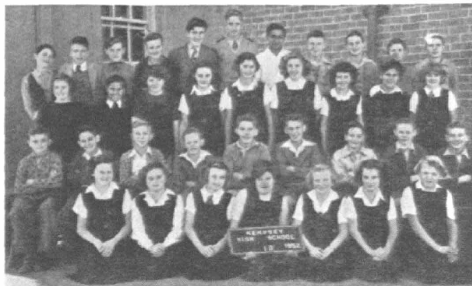
Class 10, Kempsey High School, at whose recent sports Kinchela boys did remarkably well.