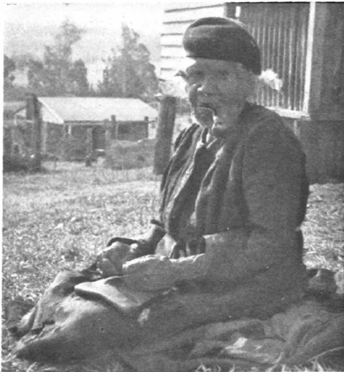
The Grand Old Lady of Woodenbong Station.