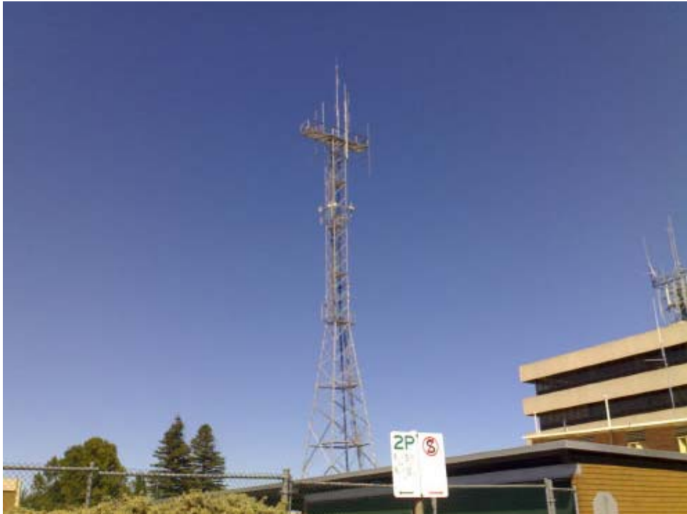
Broadcast Australia Site