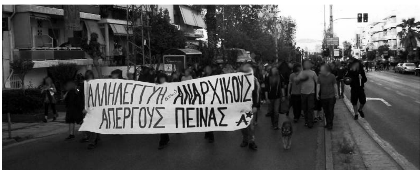
Solidarity to the hunger strikers