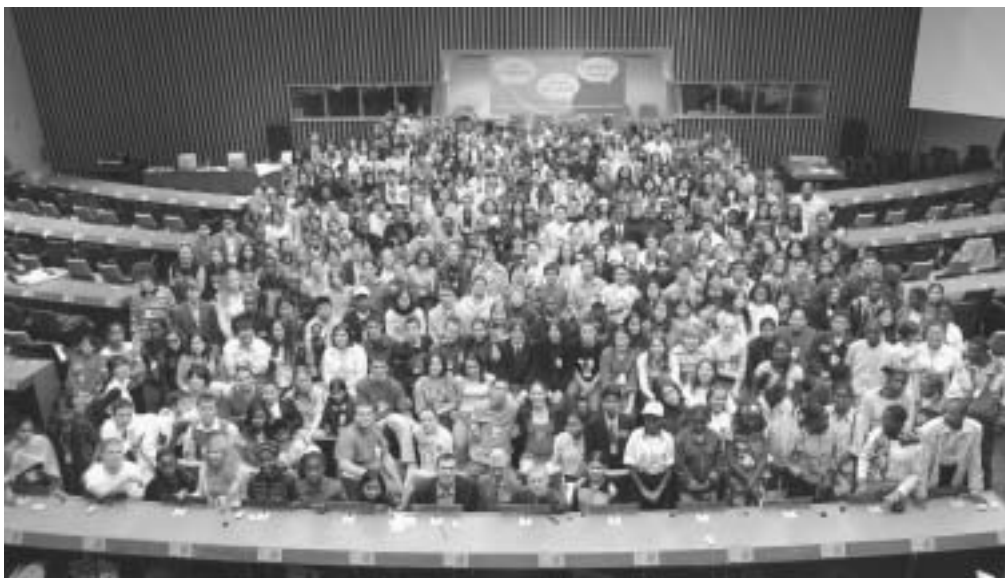
Group portrait of delegates to the Children's Forum

Children also gathered with government and NGO representatives to review the proceedings and outcome of the Children's Forum and the issues it had covered. The event was planned and conducted entirely by the children themselves, who outlined the issues and then suggested the actions governments and young people could take to address them. The children recommended the establishment of leadership training workshops as well as national, regional and international children's councils. These councils would meet regularly to monitor governments' efforts to fulfil their promises to children.