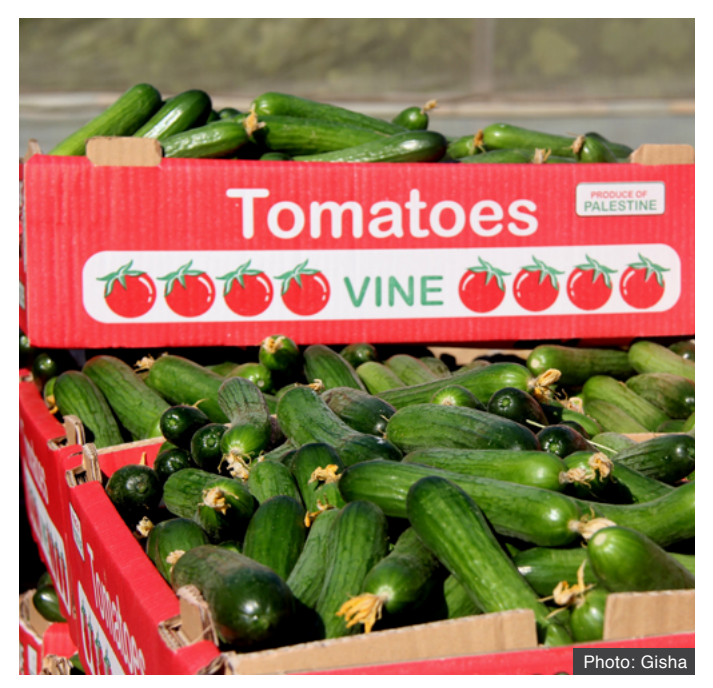
In November 2014, Israel began allowing farmers in Gaza to sell some kinds of produce to the West Bank, subject to quotas. November 2014

As noted above, Israel also restricts the transfer of goods from Gaza to markets in the West Bank and Israel, contributing to a split and overall downturn in the Palestinian economy. Beginning in 1967, Gaza was cut off from Egypt and was not permitted to operate an airport or seaport. Instead, its industries were developed to serve the Israeli and West Bank markets, taking advantage of low-cost labor in Gaza to sell high volume and low profit-margin produce and manufactured goods. The closure of those markets effectively crippled Gaza's economy, contributing to high unemployment and a dip in GDP per capita – which is currently lower than it was