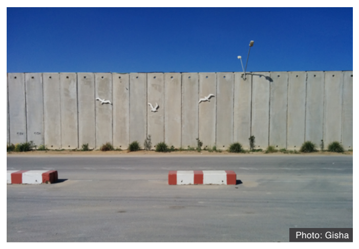
The Kerem Shalom Crossing between Gaza and Israel has become Gaza's sole commercial crossing. March 2015