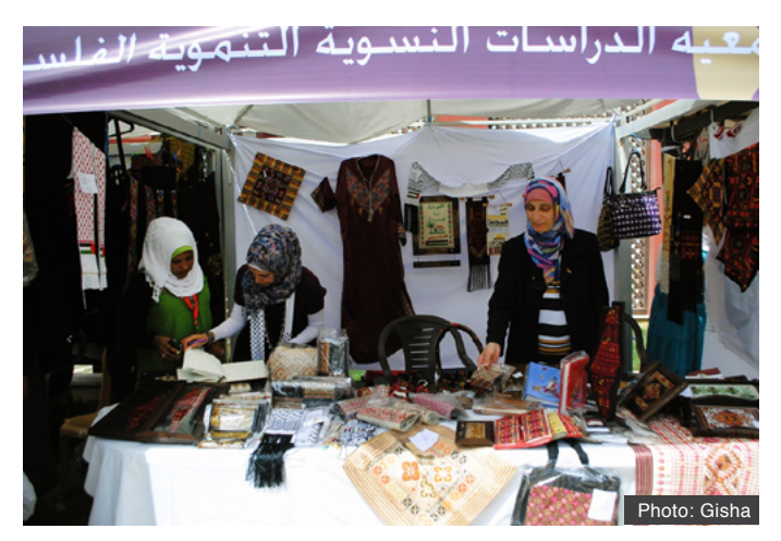
Women selling embroidery at an exhibition in Gaza. Marketing to the West Bank and Israel is blocked. March 2013

Respect for the right of members of a people jointly to pursue such communal enterprises overlaps considerably with the effective realization of individual rights that they possess. Thus, failure to respect the former will inevitably compromise individual rights such as freedom of association and the right to take part in cultural life. The Conversely, when a state acts in violation of individual rights it may, in so doing, also undermine the right to pursue collective endeavors. For example, a people's capacity to pursue its economic, social and cultural development is likely to be compromised when the members of the group are denied access to educational opportunities in their community in violation of their individual right to education. Similarly, when a state