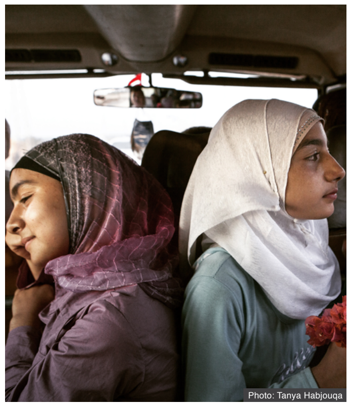
Two girls in a car on a road trip. October 2009

In Part Three we assess the policy under international human rights law. We argue that irrespective of whether or not Gaza and the West Bank constitute a state, the individual human right to freedom of movement applies to Palestinians wishing to travel between the two parts