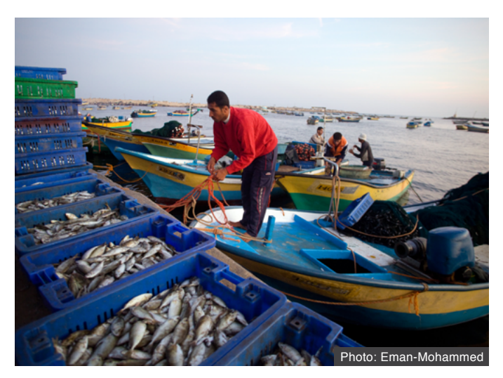
Fishermen in Gaza. Israel limits fishing to six nautical miles from the shore. October 2010

In the case of Gaza and the West Bank, Israel first committed to recognizing them as a single territorial unit as part of the Camp David Accords that gave it the substantial benefit of peace with Egypt and significant financial assistance from the United States,98 which brokered the deal. It reaffirmed that recognition in the Oslo accords, which afforded it diplomatic benefits of closer ties to the United States99 and Europe and an implicit recognition, by the PLO as the representative of the Palestinian people, of Israel's borders within the 1949 Armistice lines. Within its domestic legal system, it insisted on the territorial unity of Gaza and the West Bank in order to assert the scope of Israel's authority under the law of belligerent occupation. Relying on that recognition, Palestinian institutions, governmental and nongovernmental, were established in both parts of the territory, including government offices, programs of higher education, civil society organizations and businesses with branches in both Gaza and the West Bank and serving Palestinians throughout the Palestinian territory. Donor countries funded programs and institutions designed to serve Palestinians in both Gaza