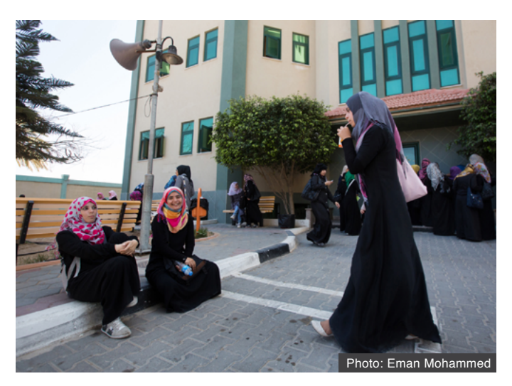
Students outside the College of Applied Sciences of Gaza. April 2013

In addition to its necessity as a precondition for meeting obligations to civilians living under occupation, freedom of movement has been recognized throughout history as a right in itself whose expression is a realization of human autonomy and dignity. As early as ancient Greek times, freedom of movement was one of the features that distinguished a free person from a slave. It was protected, to varying degrees, in early codifications of rights such as the English Magna Carta and the French revolutionary constitution of 1791. Freedom of movement was seen as necessary for human and economic development, and its denial was viewed as a tool of subjugation. In modern times, it was enshrined in the Universal Declaration of Human Rights and eventually in the International Covenant on Civil and