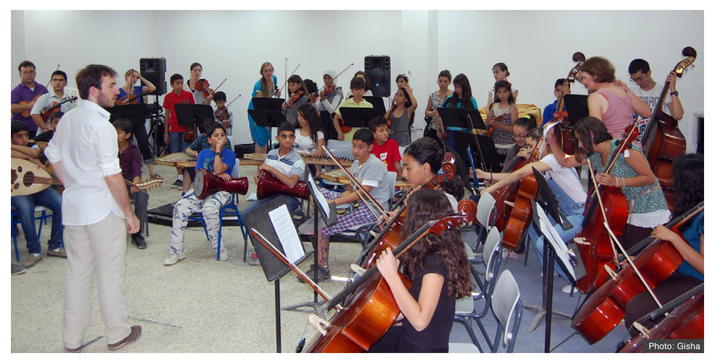
Children from Gaza get a rare permit to participate in a music summer camp in the West Bank. July 2012

This position paper is written at a dynamic time in the implementation of the separation policy. Since the end of the 2014 wide-scale military operation, Israel has expanded the flow of goods into and out of Gaza and to a lesser extent has expanded travel via Erez Crossing for short-term purposes. 147 Senior military officials, including the defense minister and the outgoing army chief of staff, have said that they view economic development in Gaza as promoting stability and ultimately security for Israelis. 148