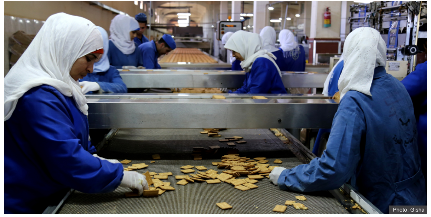
Workers at a biscuit factory in Gaza that used to sell to the West Bank. March 2015

deepening the divide in the Palestinian health care system.