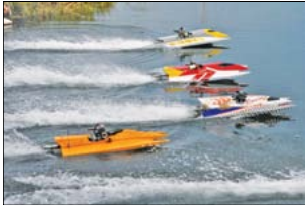
Unlimited Northwest Model Boat Races will be at Lake Tye June 10 and July 8.

Aug 1: National Night Out Against Crime at Lake Tye Park 6-8pm