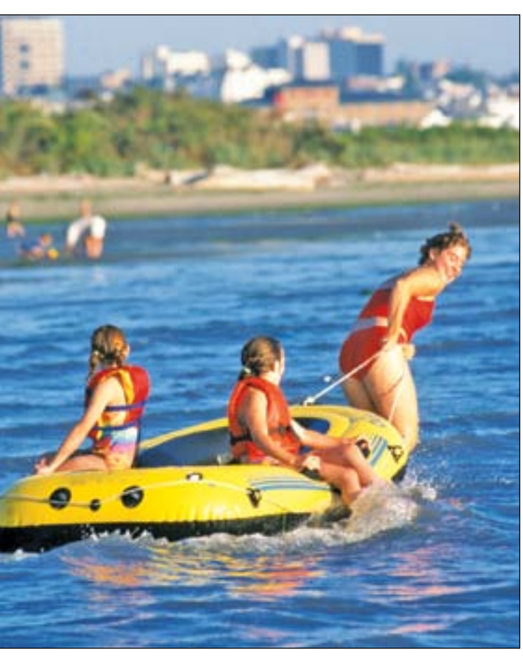
Young and old alike enjoy the shallow, warm water and sandy beaches on Everett's Jetty Island July 5 – September 5.

The summer long Jetty Island Days runs July 5 through September 5 with free programs and activities for the entire family.