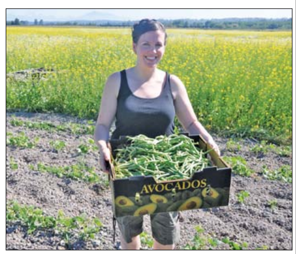
First harvest for the local food bank at The Red Barn Community Farm.

Community gardens are a place where neighbors can experience self-sufficiency, shared knowledge, social connections and of course, fresh produce. Community gardens also conserve resources and create opportunities for recreation, exercise, therapy and education.