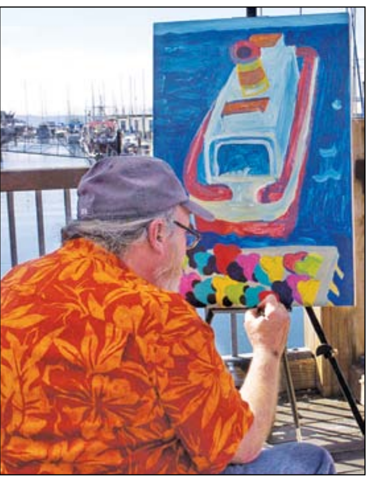
The Annual Fresh Paint, a festival of artists at work, will be Aug. 19-20 at the Port of Everett Marina.

At this event there will be more than 135 artists sharing