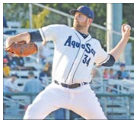
Aug. 26 – 30: Eugene Emeralds

Aug. 16 - 19: Tri-City Dust Aug. 23 – 25: Vancouver Canadians