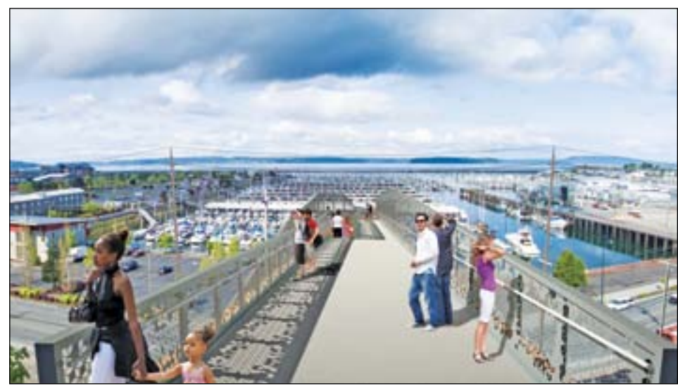
Above is an architectural rendering facing west on the future Grand Avenue Park bridge.

The guardrail and elevator tower will be lightly sandblasted with impressions of patterns found in nature, while other parts of the structure will be painted black to deter rust. The entire