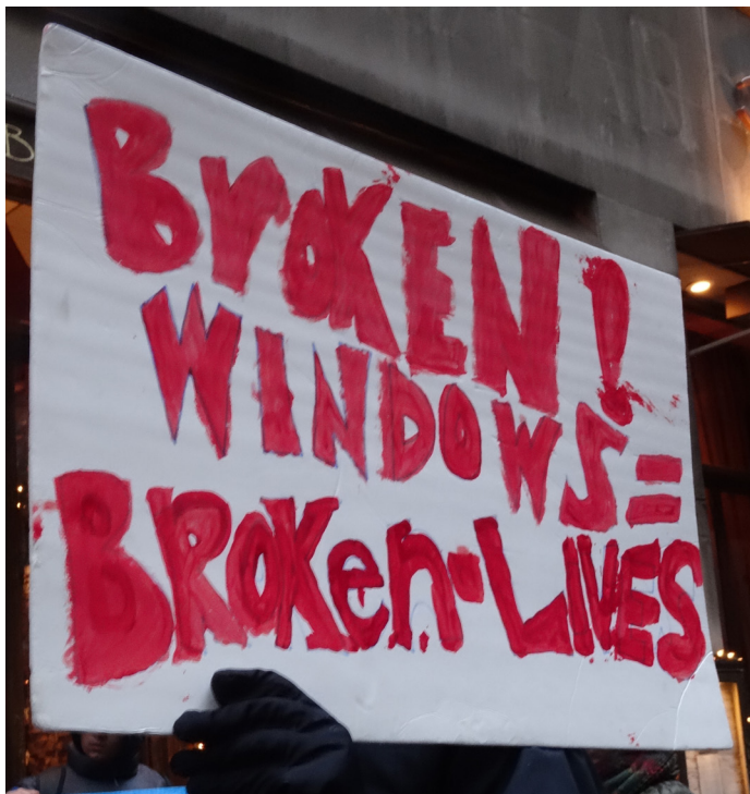
Rally against broken windows policy outside of the Manhattan Institute in New York City, December 10, 2014. Source: Hollow Sidewalks via Flickr. License: https://creativecommons.org/licenses/by/2.0/ .

Broken windows policing isn't about reducing crime, it's about assuaging white fear of poor people, Black people, and people of color—no matter how irrational or racialized.