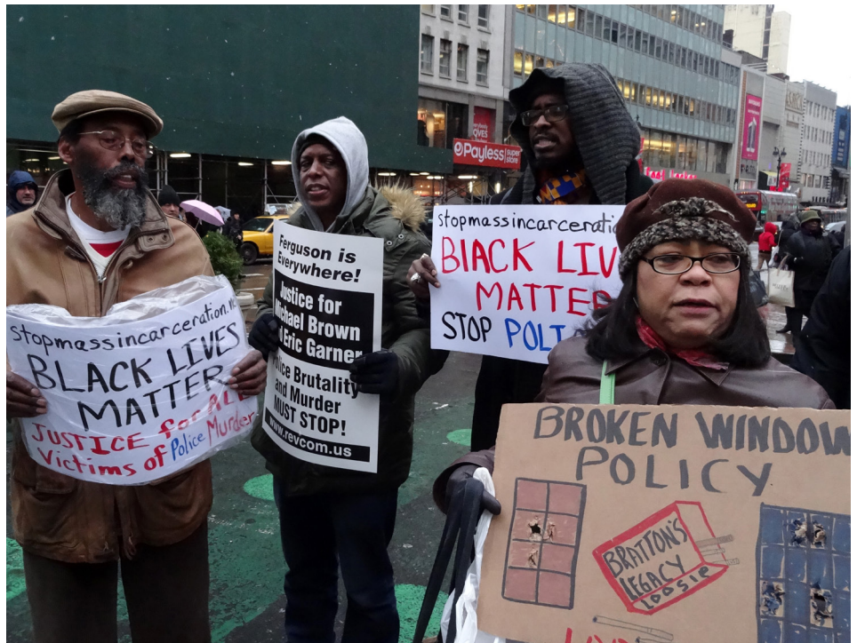
Rally against broken windows policy outside of the Manhattan Institute in New York City, December 10, 2014.

The role of broken windows policing in each death quickly became the focus of protesters from the Black Lives Matter movement and other civil rights advocates. Just days after Brown’s death, national president of the NAACP Cornell William Brooks said, “The death of Michael Brown strikes me as the latest, sad chapter in an ongoing national narrative about a form of policing, broken windows policing, that is simply not right for the country.” 2 In New York City, This Stops Today—an ad hoc coalition taking its name from Eric Garner’s words on the day he died to the officers who had repeatedly harassed him—made