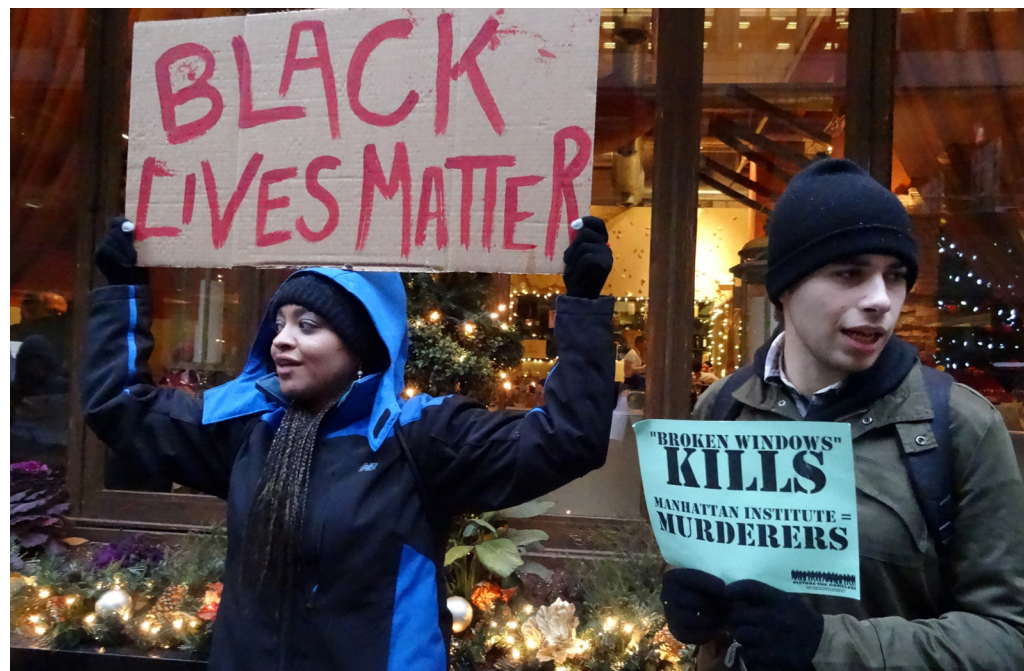
Rally against Broken Windows policy outside of the Manhattan Institute in New York City, December 10, 2014.