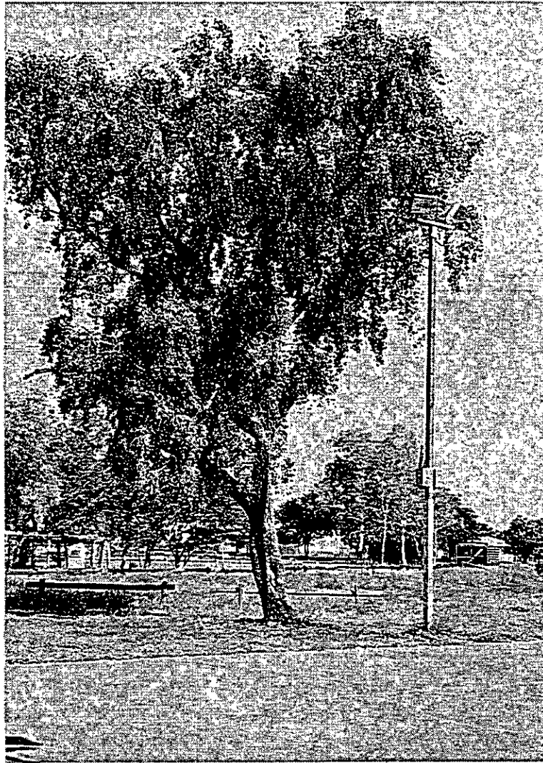
Partiki tree in the Daguargu township 1988