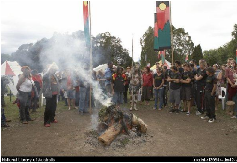
Image 13: Tent Embassy Gathering before the Apology, 2008