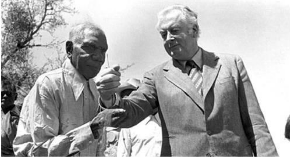
Image 14: Gough Whitlam gave the Gurindji people their victory

However, despite Whitlam establishing some limited reforms in the area of Aboriginal affairs, his tenure as PM was cut short in 1975 when his government was dismissed. Indigenous political activists now had to again deal with a conservative Liberal government in Canberra with Malcolm Fraser as Prime Minister. Fraser initially proved to be a more progressive Liberal Prime Minister than Billy McMahon. Before their dismissal, Gough Whitlam's Labor Government had drafted the Aboriginal Land Rights Act (Northern Territory) which would allow Aboriginal people in the NT to seek land grants in freehold title. It was to the credit of the incoming Prime Minister Malcolm Fraser that he ultimately passed this legislation (with minor amendments) in 1976. But Fraser's conservative government very quickly came into conflict with Aboriginal groups, especially the increasing political clout of the Aboriginal community-controlled organizations.