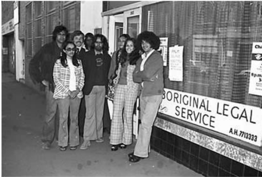
IMAGE 5 ;Australia's first Aboriginal Legal Service, Redfern 1971

with black US soldiers in Sydney on R&R from the Vietnam war, developed a close interest in such US groups as the Black Panther Party in California. 14