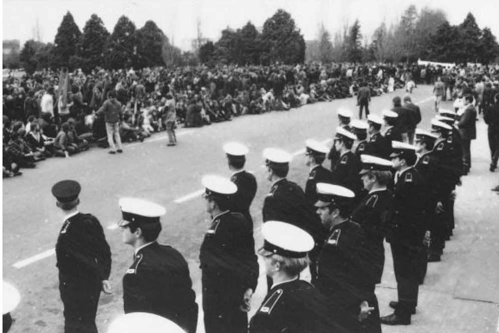
Image 12: Police and Aboriginal activists confront each other at Aboriginal Embassy 1972

injured and eighteen people were arrested. Again the violent scenes were broadcast around the world and a week later more than three thousand people marched on Parliament and set up the Embassy again. 18