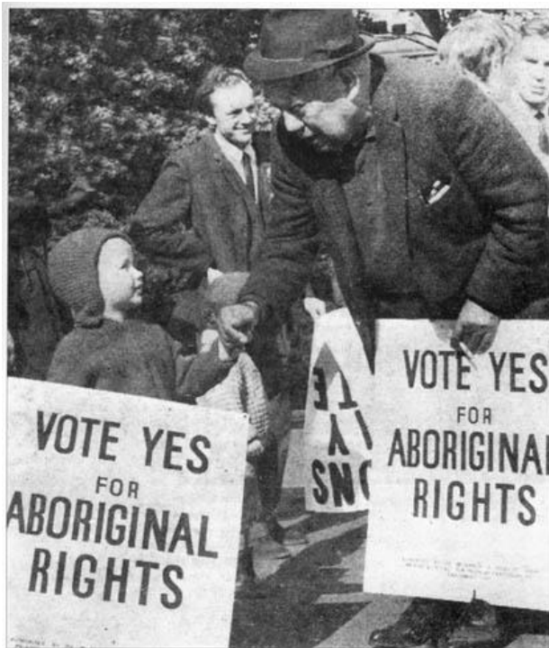
IMAGE 3: Bill Onus at Melbourne referendum rally – Sun Melbourne 27 th May 1967

generation whose white counterparts were challenging the white political mainstream over issues to do with imperialism and neo-colonialism (Vietnam) and personal freedom. Between 1968 and 1970 at the annual FCAATSI conference in Canberra, there were a series on increasingly intense confrontations between indigenous representatives and the organizational leadership who were mostly non-indigenous. Young indigenous activists were largely from the Sydney Aboriginal community in Redfern and were arguing for 'Black control of Black Affairs', which was also being promoted as the idea of 'Black Power'.