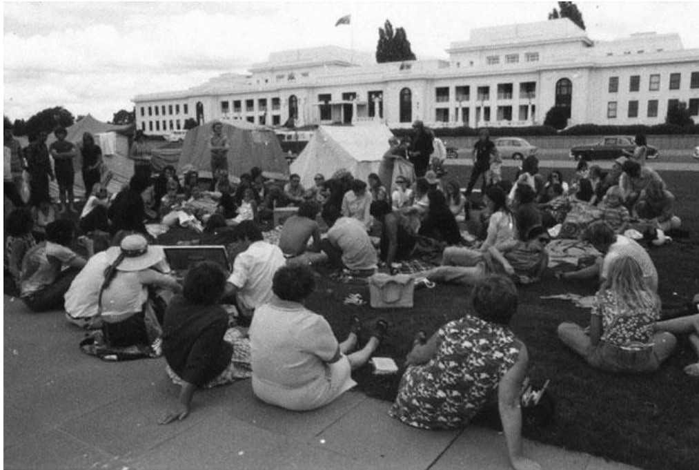
Image 11: Tent Embassy meeting (with Parliament House in the background),

people. This was a significant moment in Australian history and would directly result in 1976 in the Northern Territory Land Rights Act. 17