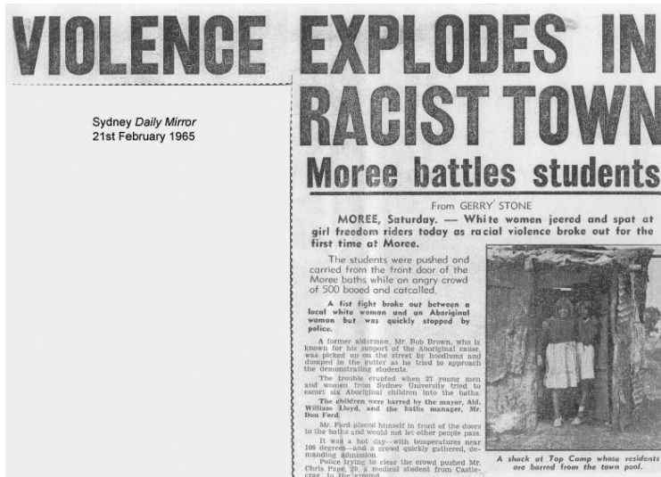
IMAGE 2: Report on protest in Moree, NSW, 21 Feb 1965, Sydney Daily Mirror

The 'Freedom Ride' exposed Australian racism to the world and as such was a significant embarrassment to the Australian Government and nation. It also had the more important effect of radicalizing a new generation of activists who were teenagers when the 'Freedom Ride' passed through their towns and they saw the local white racist establishment exposed and challenged in the most powerful way. The Freedom Ride was an internationally inspired, product of cooperation between whites and blacks committed to the same ideals, confrontationist but non-violent, the Freedom Ride was a consciousness-raising exercise that was very effective. Awakening media interest in Aboriginal affairs was marshalled in favour of the Black Australian cause, to the severe embarrassment of many white townspeople in rural New South Wales. All of these elements foreshadowed a pattern of protest that was to continue and expand in the 1970s and 1980s.