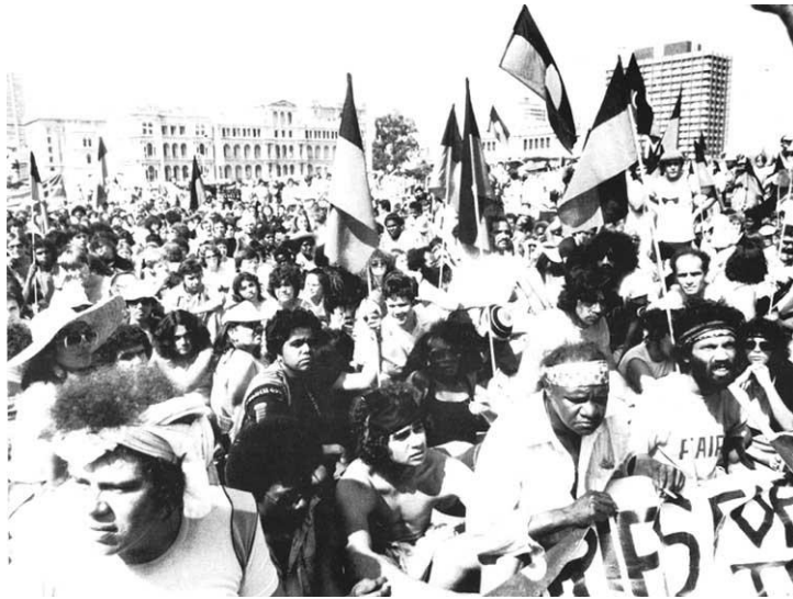
Image 16: Commonwealth Games Protest, Brisbane, 26 Sept 1982

Federal Government of Malcolm Fraser, who was until then enjoying a positive image from his efforts to assist in negotiating a peaceful settlement to racial problems in Rhodesia.