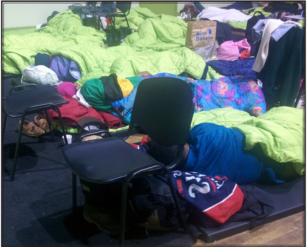
Inside a warming centre, 2017.

Having done this research, however, we are hit with a new sense of irony. Clearly it is TESS who can neither keep track of money nor can they do simple math.