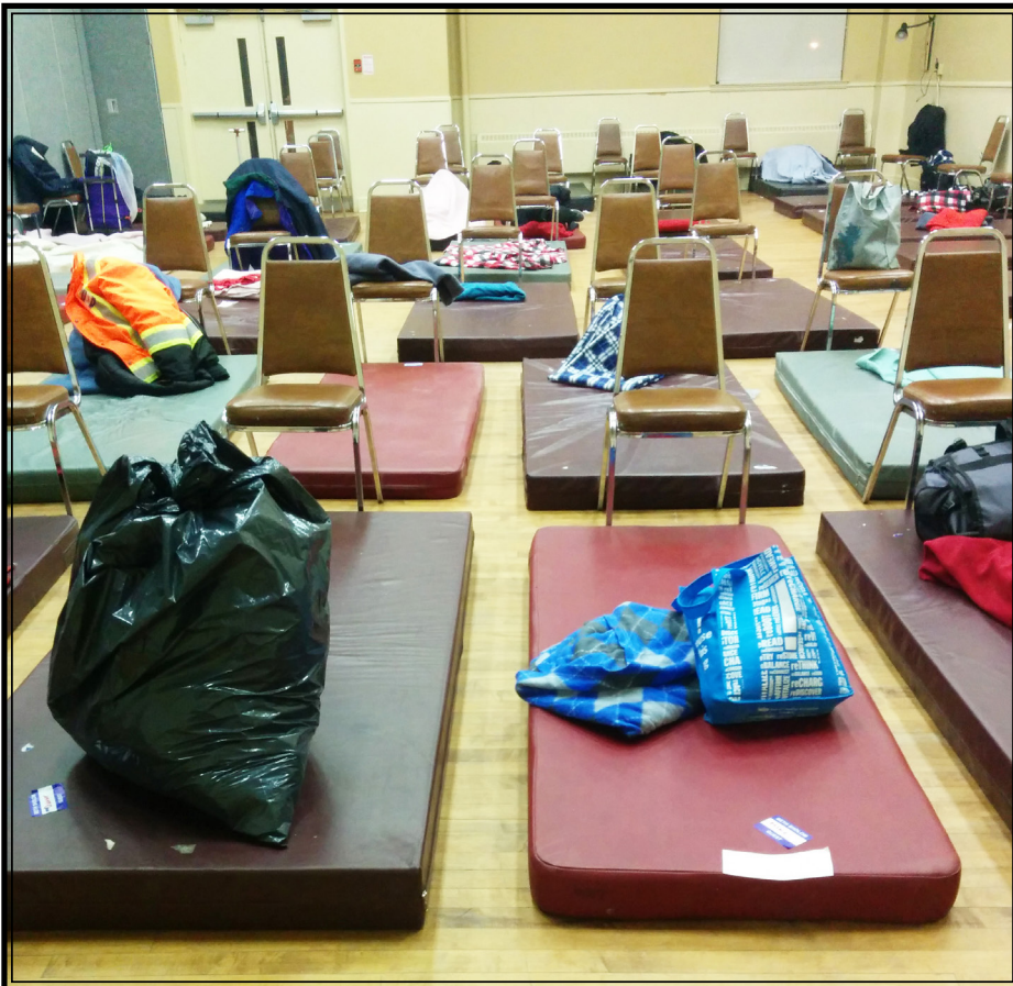
Inside an Out of the Cold, 2017

The other way the city dealt with the HSF surplus is by depositing it into a Housing Allowance Reserve fund. The reserve was created in 2013 with $3.7 million dollars of 'unallocated' HSF funds that TESS had access to. It was promised that a housing allowance program would be setup that would give