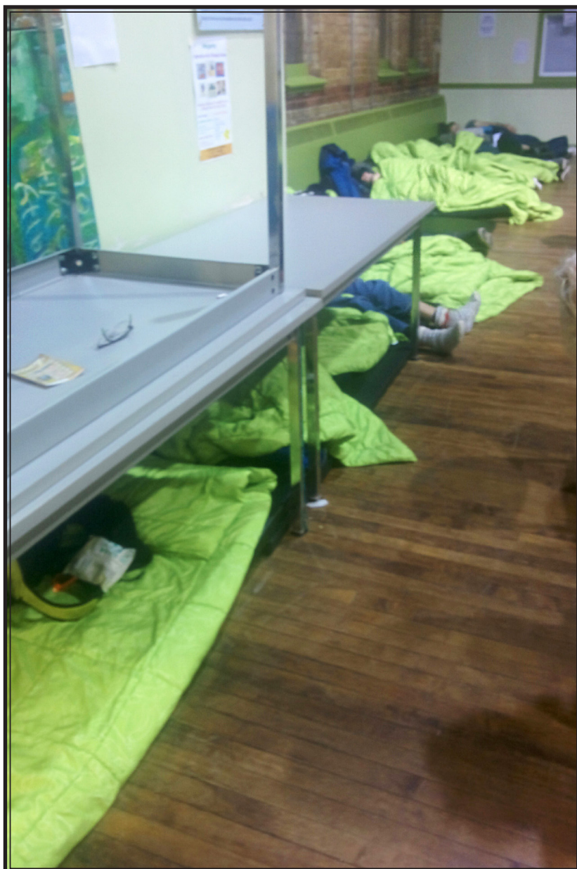
Inside a warming centre, 2017.

There are significant and concerning irregularities in the HSF expenditure and utilization figures reported by the City. These errors occur with great frequency and vary in severity. To cite just two egregious examples, there is a discrepancy in 2014 HSF expenditures of $1,004,925 between publicly reported data and what was disclosed to us in a Freedom of Information Act request, and TESS reported a difference of 8,000 HSF recipients in 2013 between the various reports it issued for that year. Various other instances of misreporting, which range from simple math done incorrectly to serious, at-times inexplicable discrepancies that have substantial impacts, lead us to conclude that there are systemic data collection and management issues within TESS.