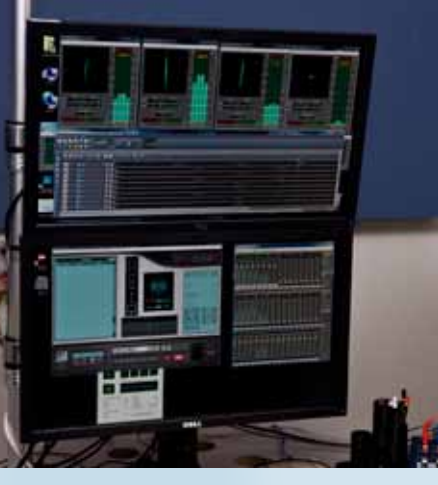
Four way or 'multiple ingest' manages workflow for digitising and monitoring multiple recordings simultaneously using a single workstation.