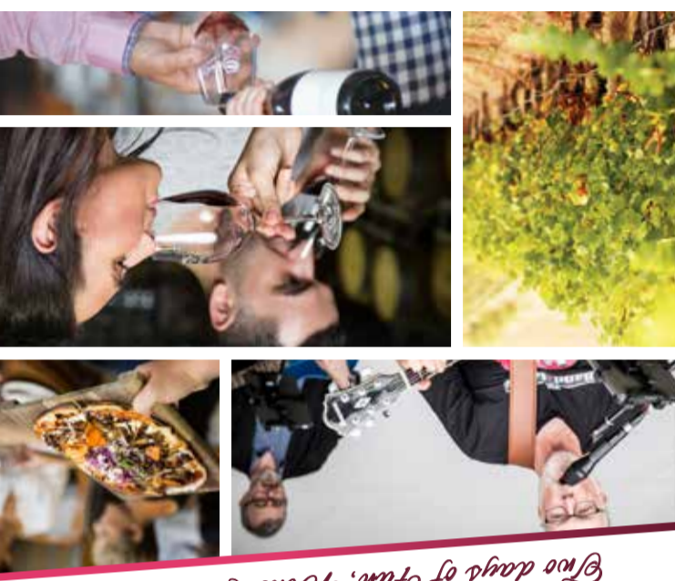
Two days of fun, wine & laughter