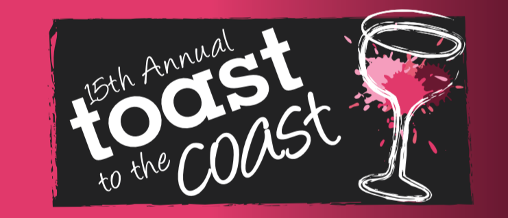
Geelong's Wine, Food & Music Festival