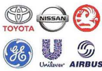
and many more companies who say they will stay

EU regulations make it harder for British firms to hire staff. Major employers like Toyota, Nissan, Vauxhall, Honda, Unilever, GE and Airbus have all said they'll stay in the UK whatever the result of the referendum.