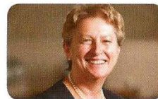
Gisela Stuart, Labour MP and Chair of Vote Leave

"The rights we have won for British workers came from our Parliament, not the EU. The EU is run in the interests of the big corporations who spend billions lobbying to make it work for them."