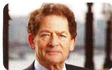
Nigel Lawson, former Chancellor of the Exchequer

"As Chancellor, I became increasingly aware that, in economic terms, membership of the EU did us more harm than good. Outside the EU, we would prosper, we would be free, and we would stand tall!"