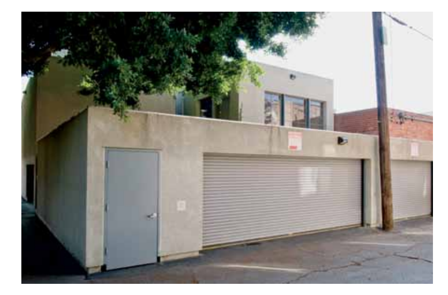
Frank Gehry, Danziger Studio and Residence, 1965, Hollywood, CA.

Subnature is both biological matter and technological material, nature and industry, organic dirt and synthetic seepage.