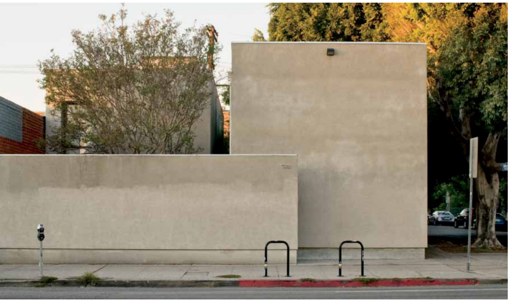
Opposite page: Eric Owen Moss Architects, Beehive, 2001, Culver City, CA.