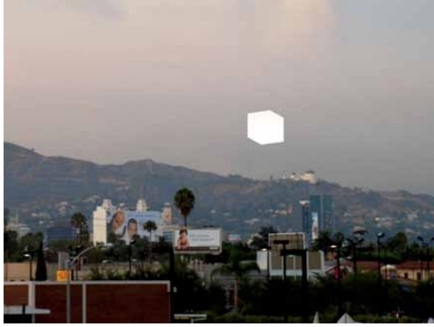
777 Tower, 1990, Los Angeles.