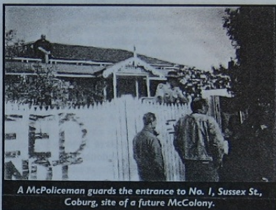
A McPoliceman guards the entrance to No. 1, Sussex St., Coburg, site of a future McColony.