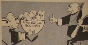
The cartoon which appears on this page is from a leaflet produced by students, stewards and seamen from the "Maroon" and "Kawarra". See election story on bottom.

The 1972 First National Congress of the Socialist Party will be an important event in the working class movement of Australia.