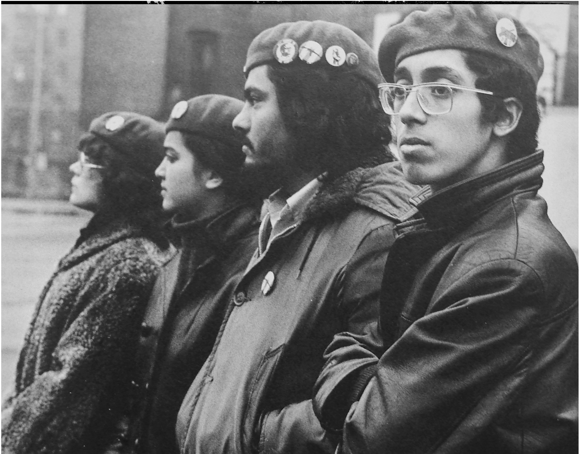
young Lords Party 1970